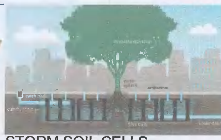
STORM SOIL CELLS