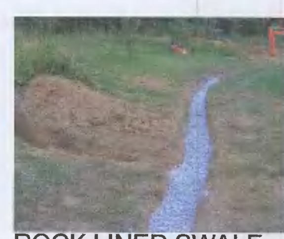
ROCK LINED SWALE

NOTE: Refer to schedule to job stage. DESIGN: All drawings are the property of Clarke & Co. and are not to be used for any other purpose. Any changes made to these drawings are subject to approval by the design team. It should also be noted that any change of the design on the drawings is the responsibility of the design team. PLANNING: All drawings are for planning purposes only and are not to be used for any other purpose. Any changes made to these drawings are subject to approval by the design team. It should also be noted that any change of the design on the drawings is the responsibility of the design team. CONSTRUCTION: Drawings are to be checked on site by the design team. The engineer is not to be held responsible for any discrepancies. The engineer is not to be held responsible for any discrepancies. The engineer is not to be held responsible for any discrepancies. NOTE: This drawing is the property of Clarke & Co. and shall not be used, reproduced, or distributed in any form without the prior written permission of Clarke & Co. and shall be returned upon request. DOCUMENT CONTROL (OFFICE USE ONLY) OF 08.30 ISSUE DATE: 26/01/2021 REV. 01