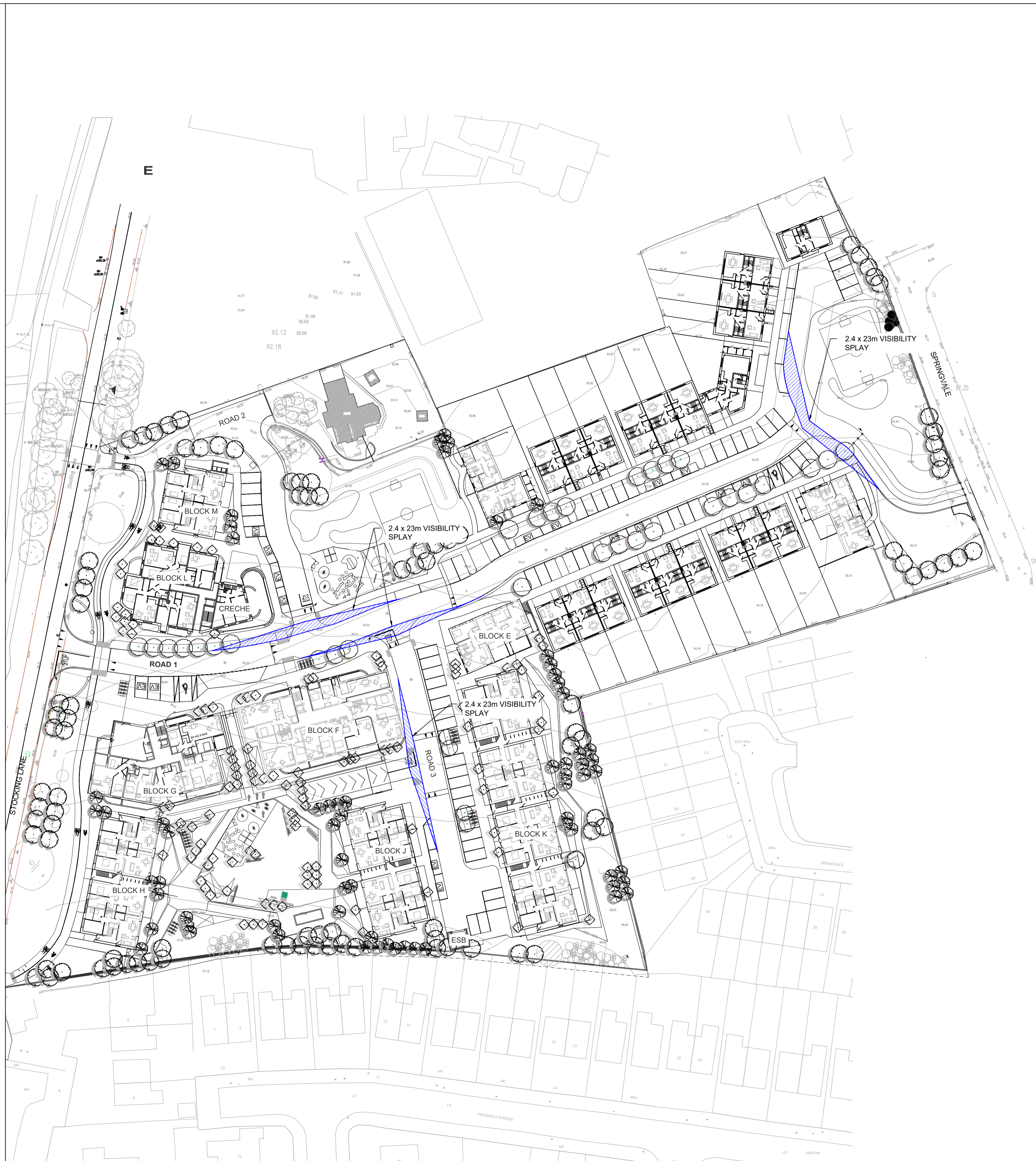
B VISIBILITY SPLAYS