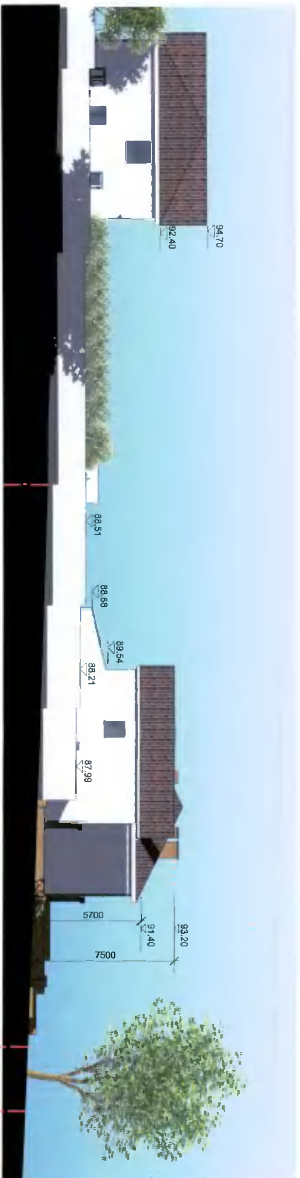
37, Beverly Heights Contiguous side elevation (East) to Scholarstown Road - Existing