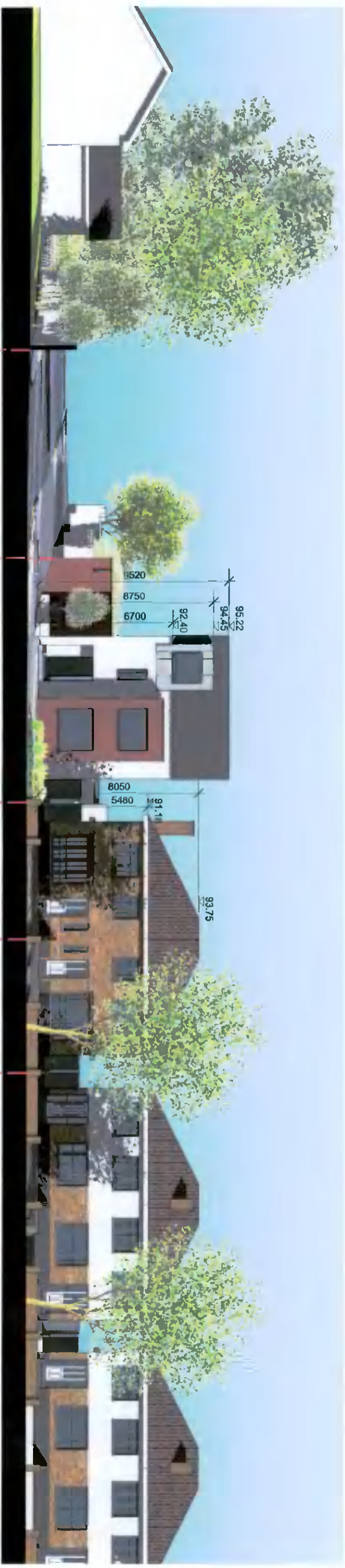
1A, The Rookery Scholarstown Road Contiguous front elevation (North) to Beverly Drive - Proposed