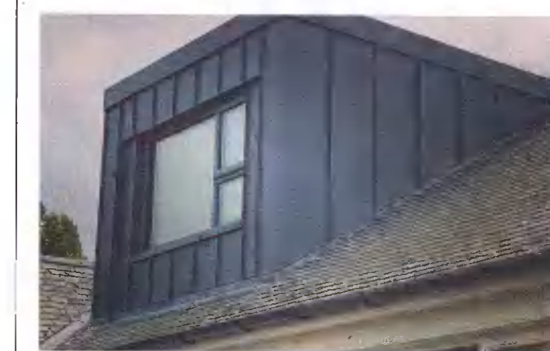
Reference Image showing the style and working of the Proposed Balcony to the Bedrooms