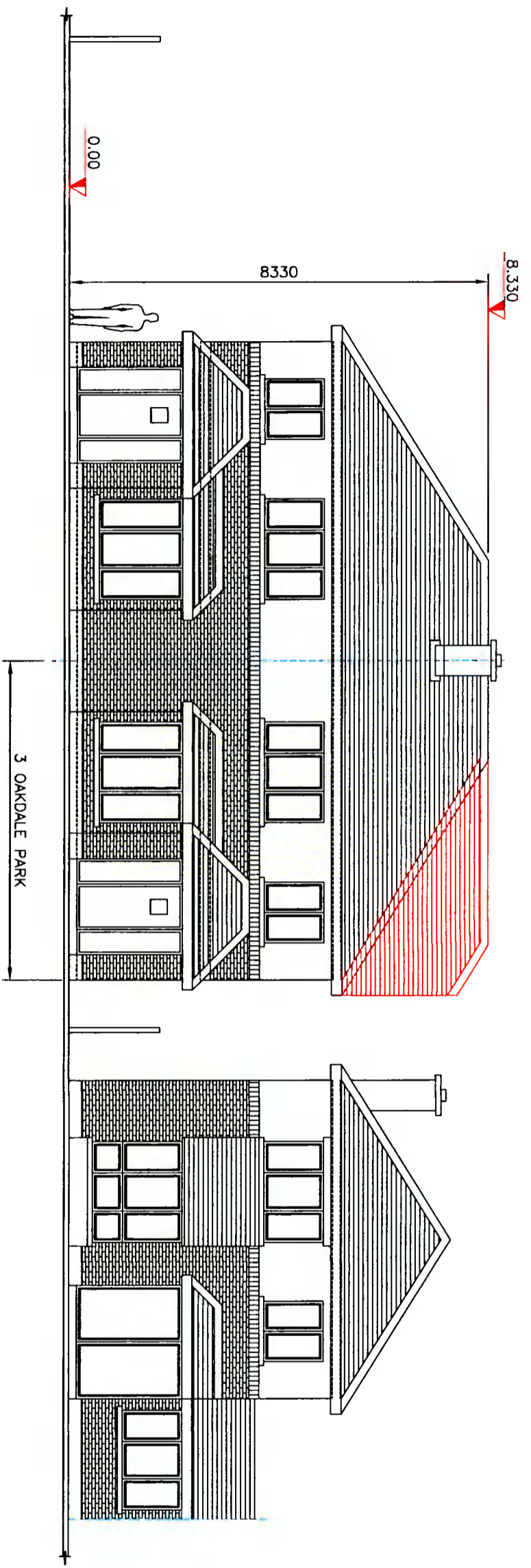
PROPOSED FRONT ELEVATION - CONTIGUOUS