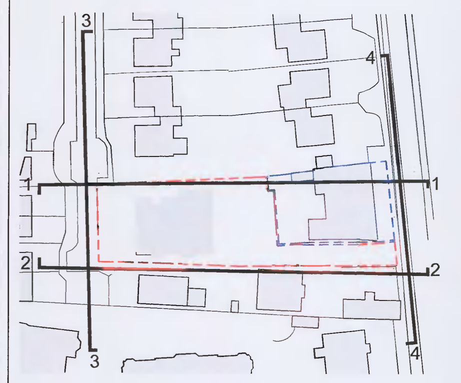
Site key plan showing the location of the proposed development on the site.

SITE BOUNDARY - - - - - OWNERSHIP BOUNDARY - - - - -