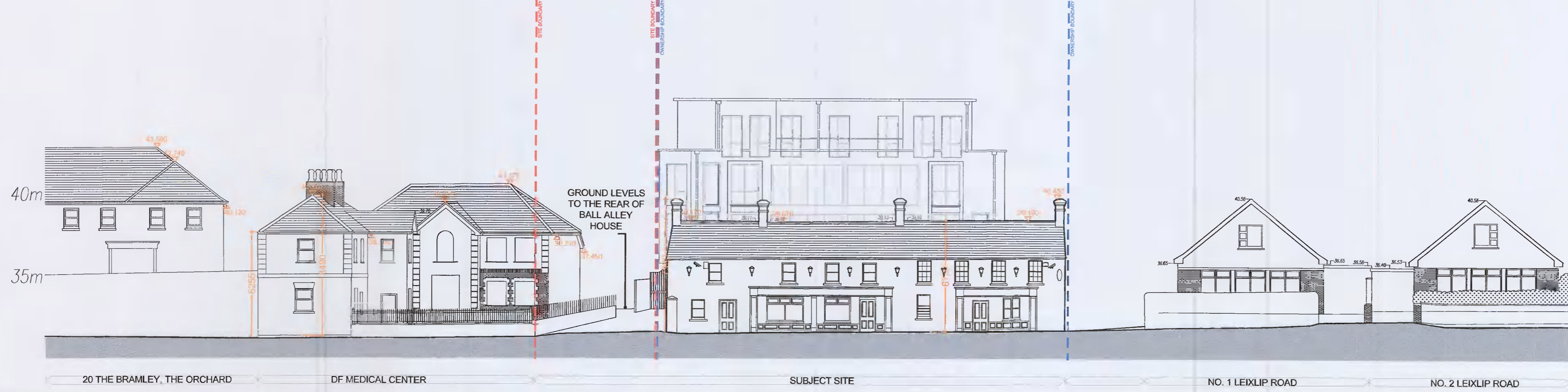
PROPOSED NORTH ELEVATION 4-4 BALL ALLEY HOUSE, LUCAN, CO. DUBLIN Scale: 1:200

SITE BOUNDARY - - - - - OWNERSHIP BOUNDARY - - - - -