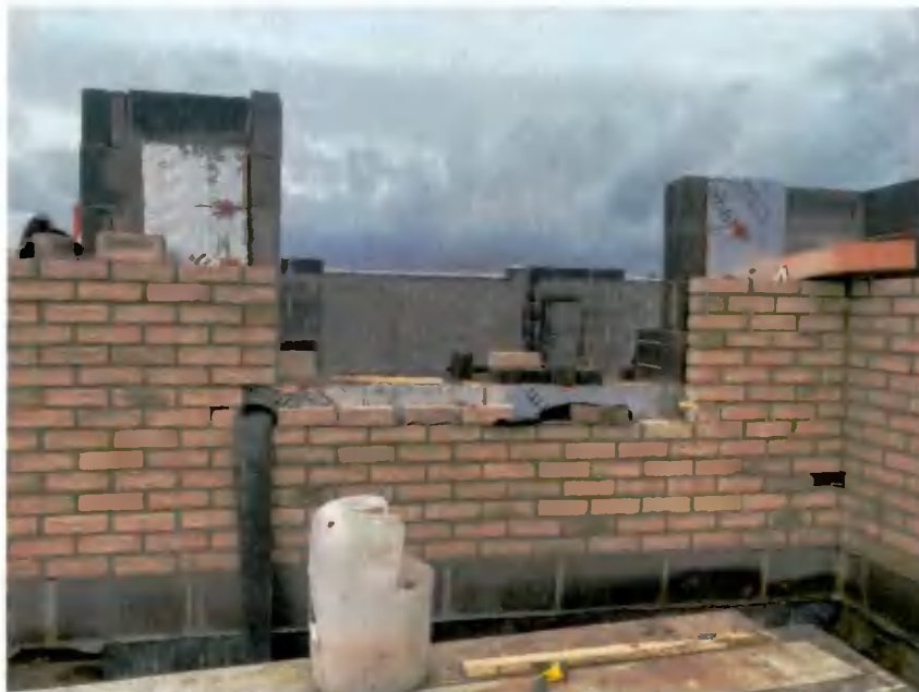
Photographs 4: Brickwork, wall ties, insulation and damp proof course