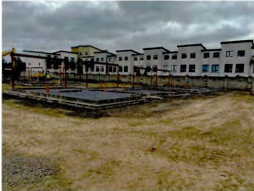
Photographs 2: Foundations, drainage, external walls and structural Steel