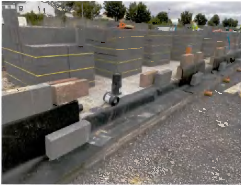
Photograph 3: Foundations, blockwork and placing of damp proof course