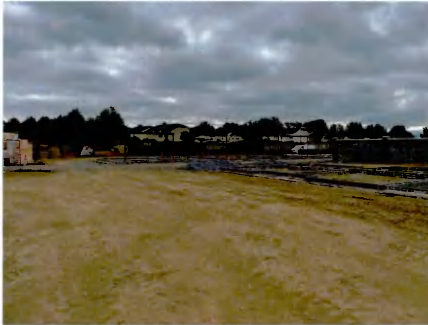
Photograph 1: Site clearance, boundary wall, blockwork, drainage and structural steel