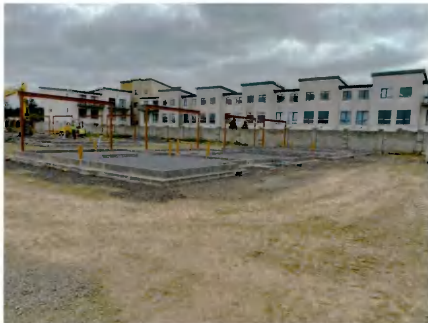
Photographs 2: Foundations, drainage, external walls and structural Steel