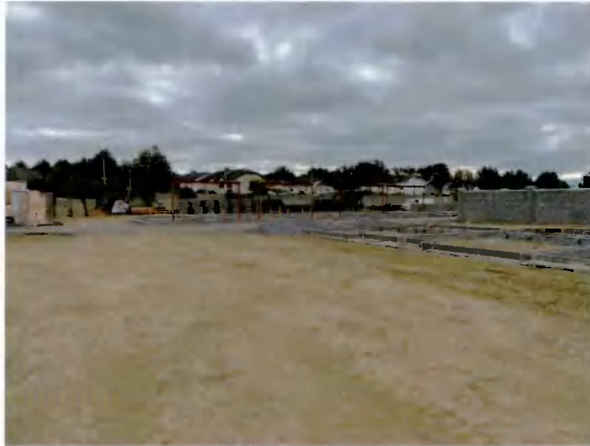
Photograph 1: Site clearance, boundary wall, blockwork, drainage and structural steel