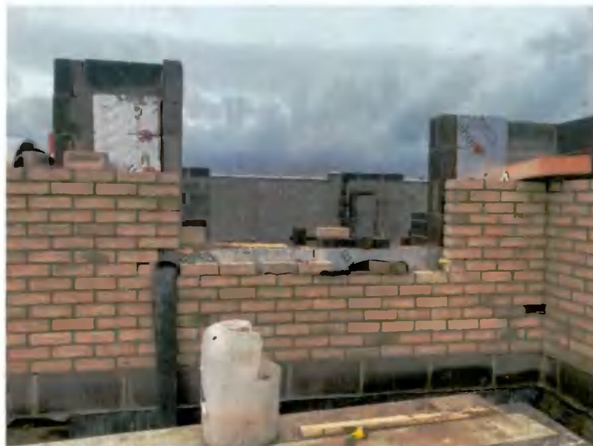
Photographs 4: Brickwork, wall ties, insulation and damp proof course