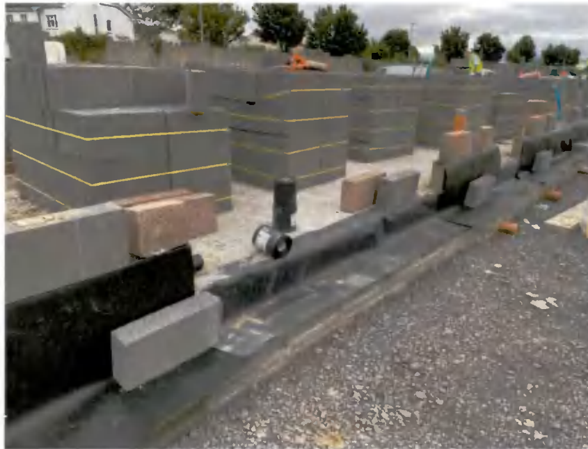
Photograph 3: Foundations, blockwork and placing of damp proof course