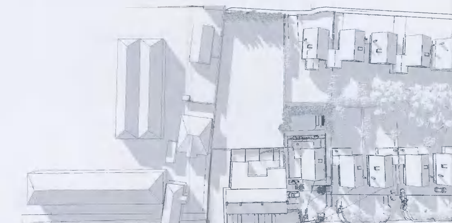
SEPTEMBER 21st - 3pm (EXISTING)