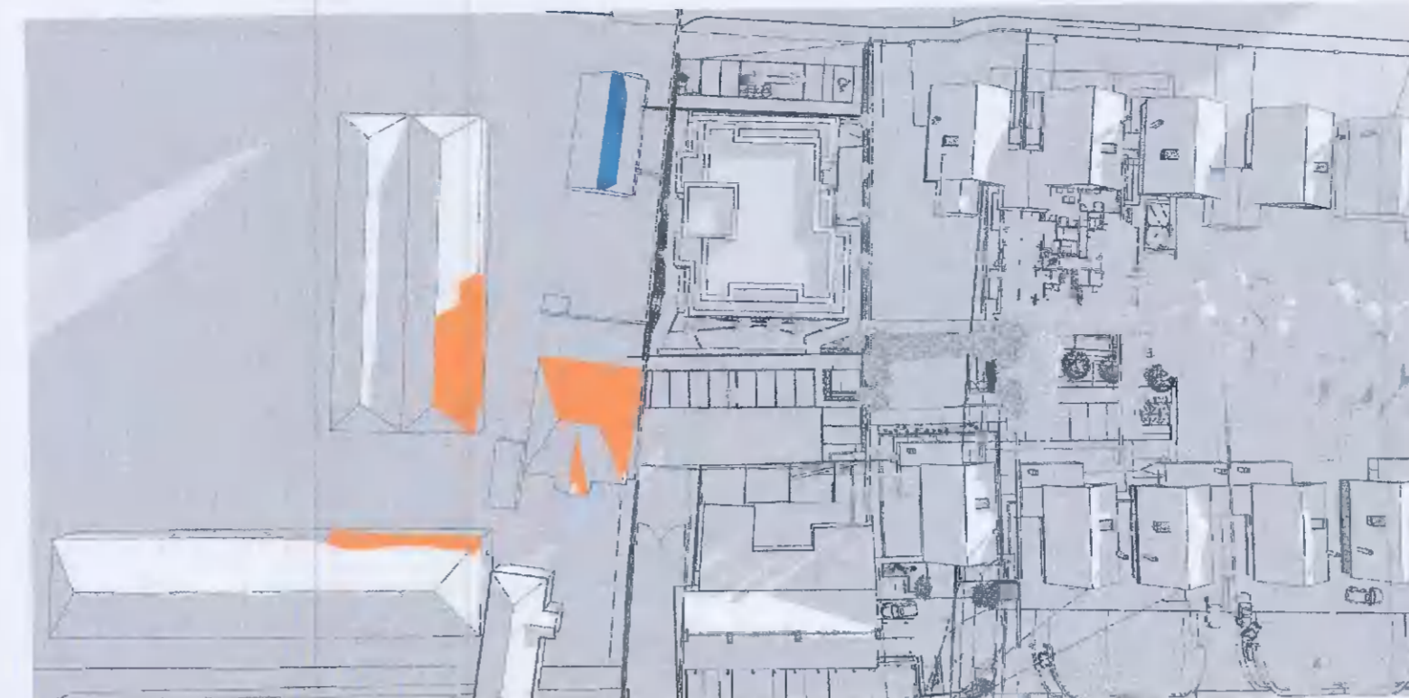
DECEMBER 21st - 3pm (WITH PROPOSAL)