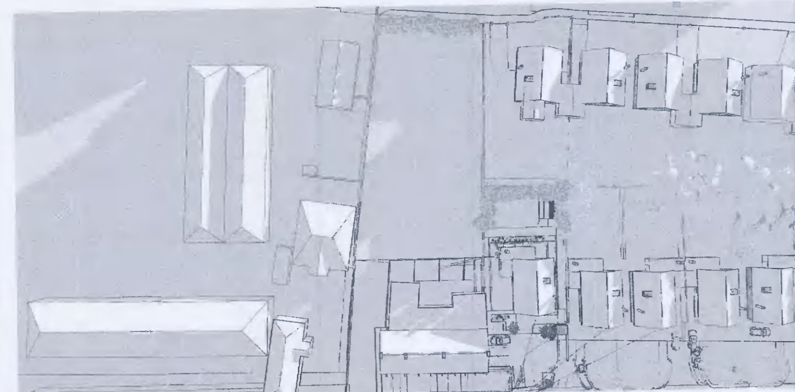
DECEMBER 21st - 3pm (EXISTING)