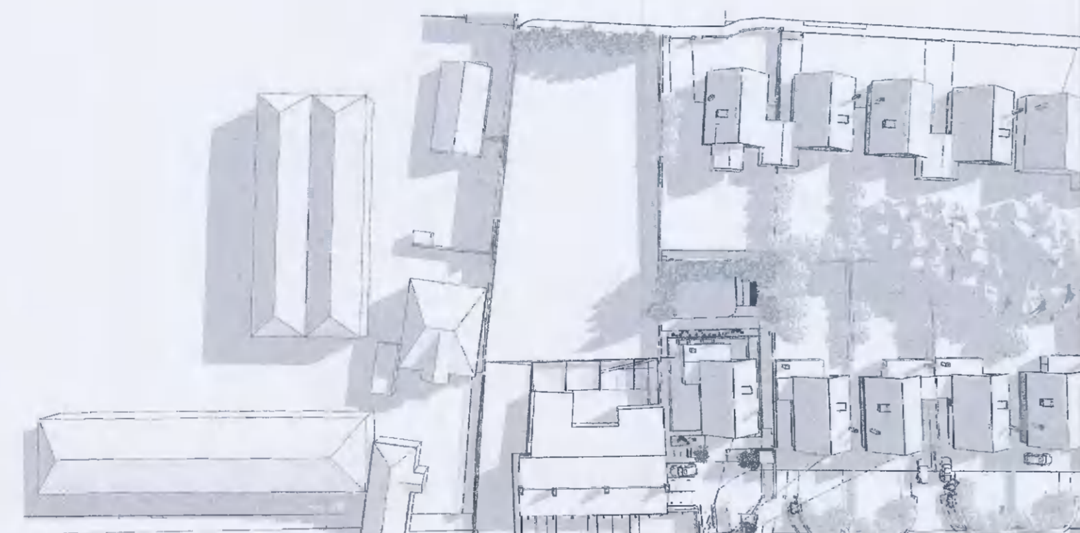
MARCH 21st - 3pm (EXISTING)