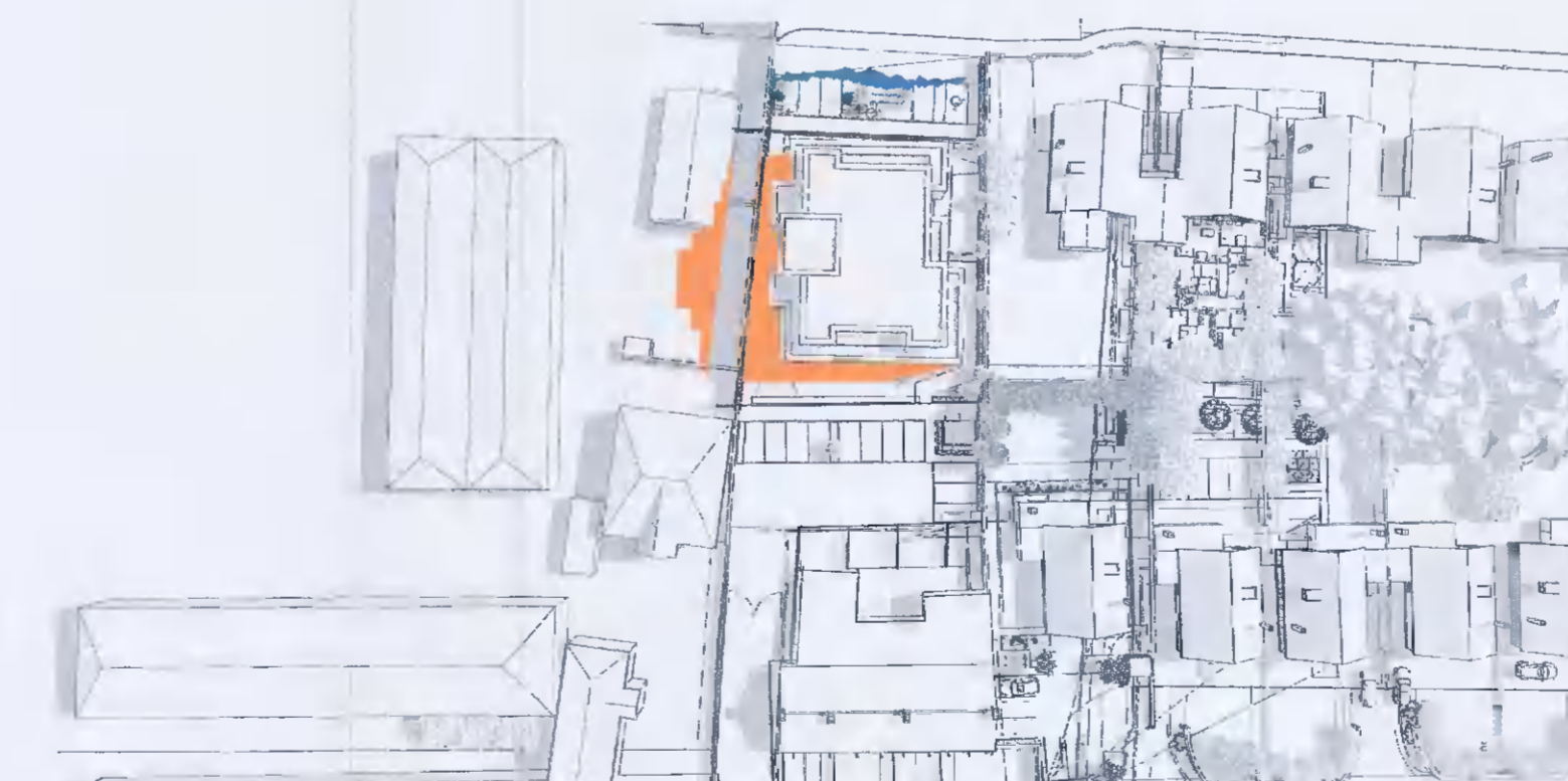
JUNE 21st - 3pm (WITH PROPOSAL)