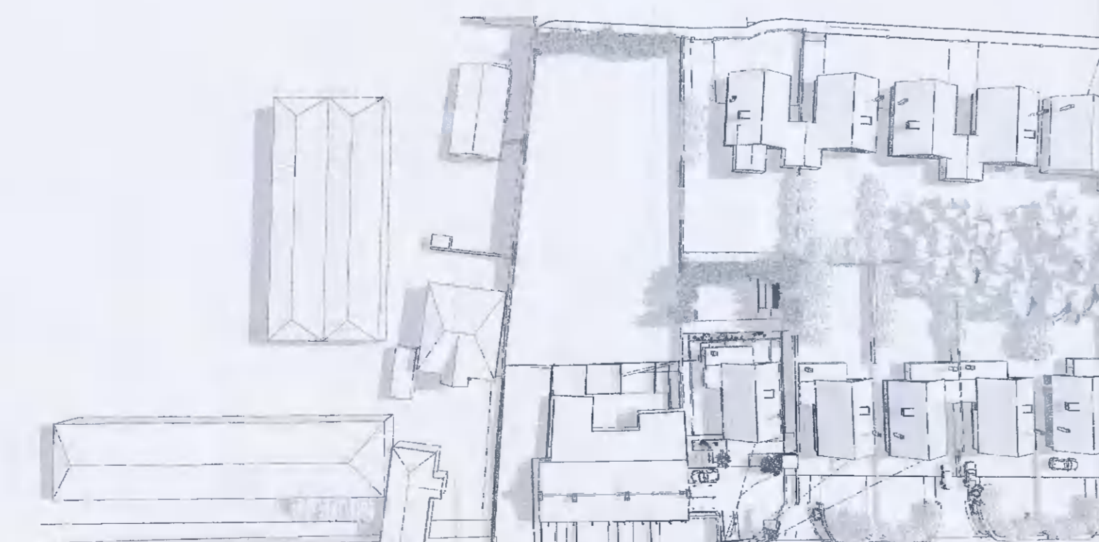
JUNE 21st - 3pm (EXISTING)