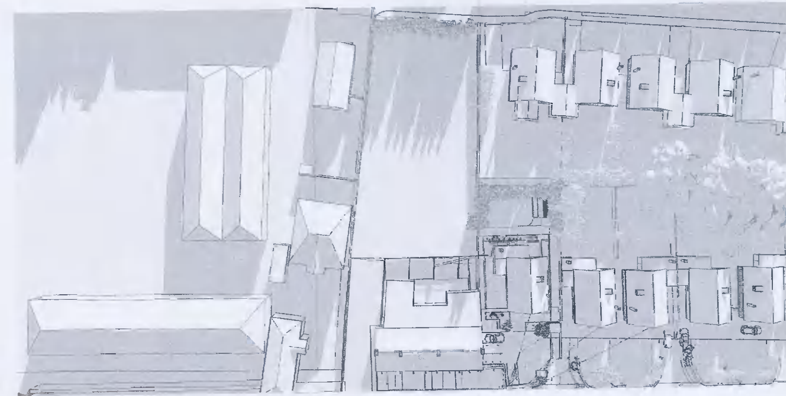
DECEMBER 21st - 12pm (EXISTING)