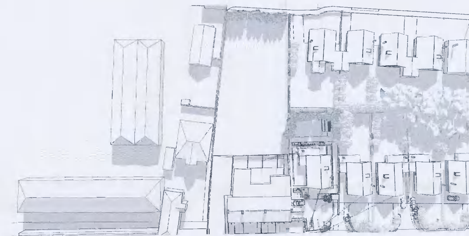
MARCH 21st - 12pm (EXISTING)