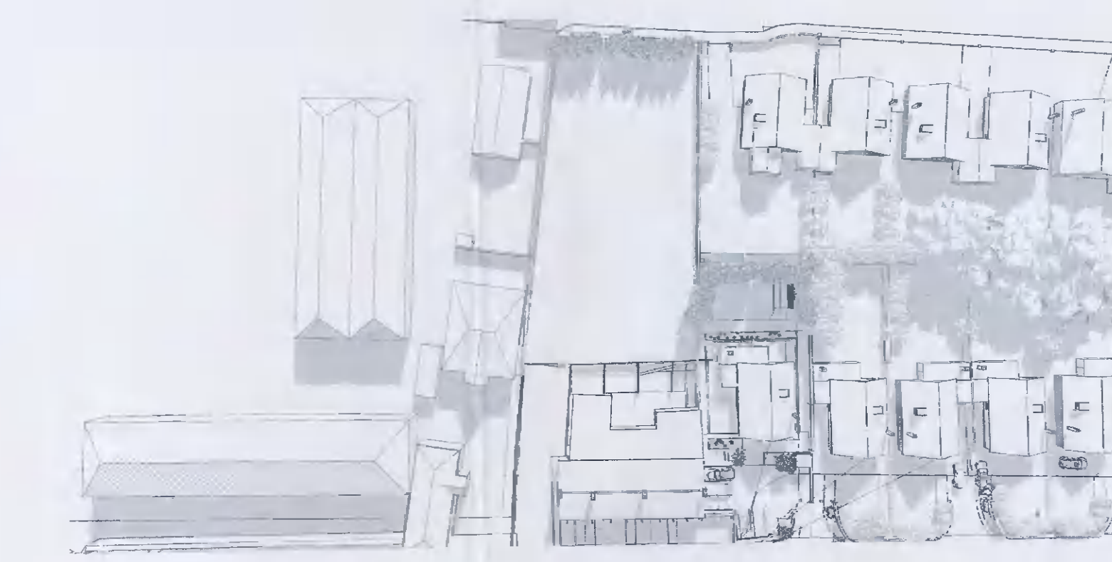
SEPTEMBER 21st - 12pm (EXISTING)