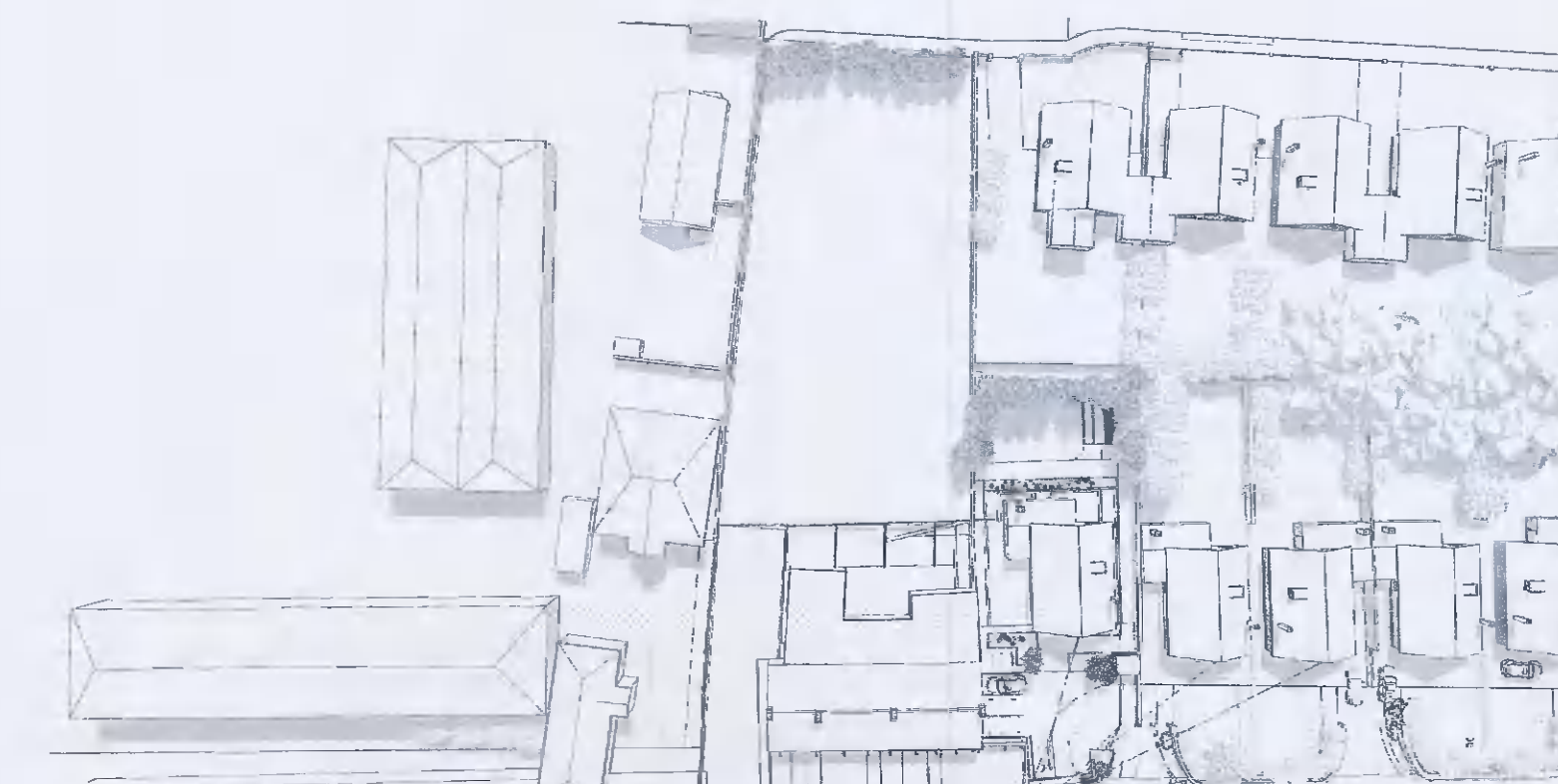
JUNE 21st - 12pm (EXISTING)