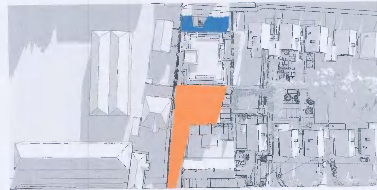
DECEMBER 21st - 12pm (WITH PROPOSAL) Note: