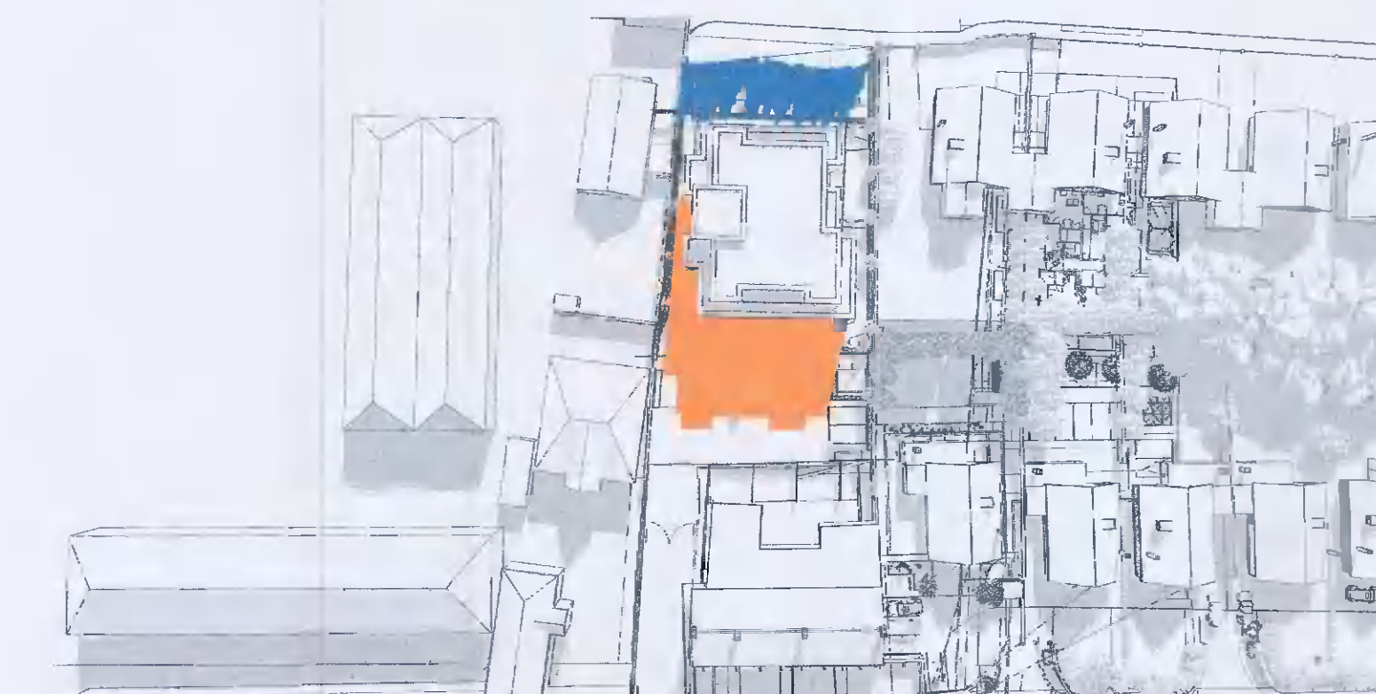
SEPTEMBER 21st - 12pm (WITH PROPOSAL) Note:

AREA OF SHADOWING OF PROPOSED DEVELOPMENT █ AREA OF SHADOWING CAUSED BY EXISTING TREES / SHRUBBERY NOW OMITTED █