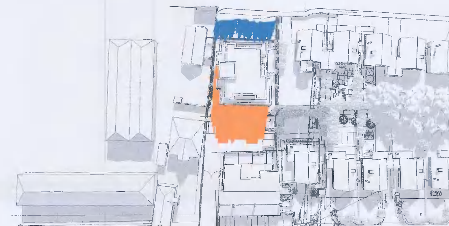
MARCH 21st - 12pm (WITH PROPOSAL) Note: