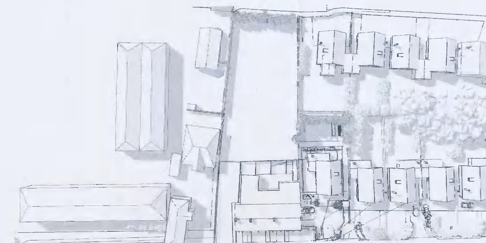
JUNE 21st - 9am (EXISTING)