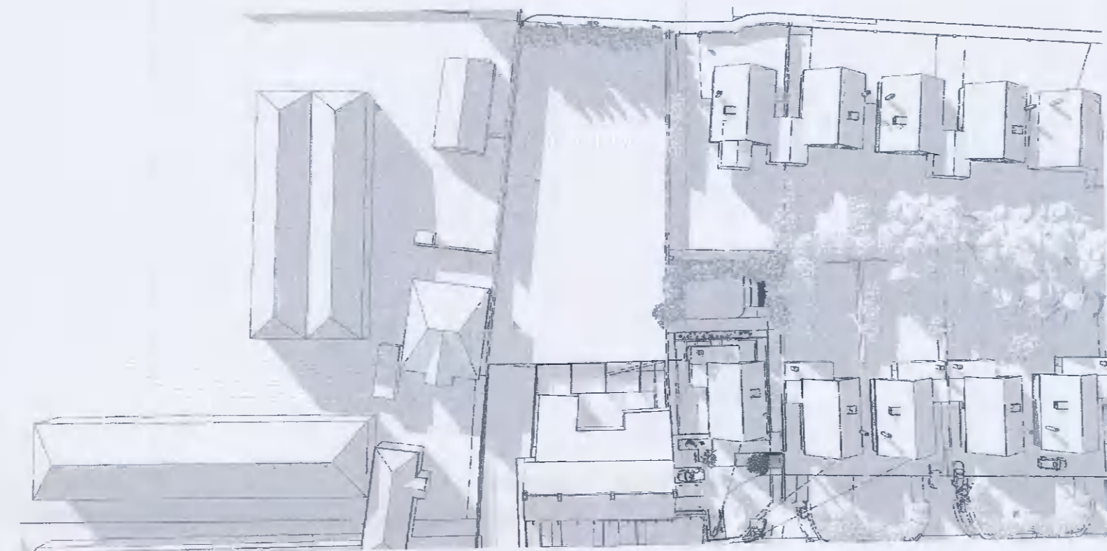
MARCH 21st - 9am (EXISTING)