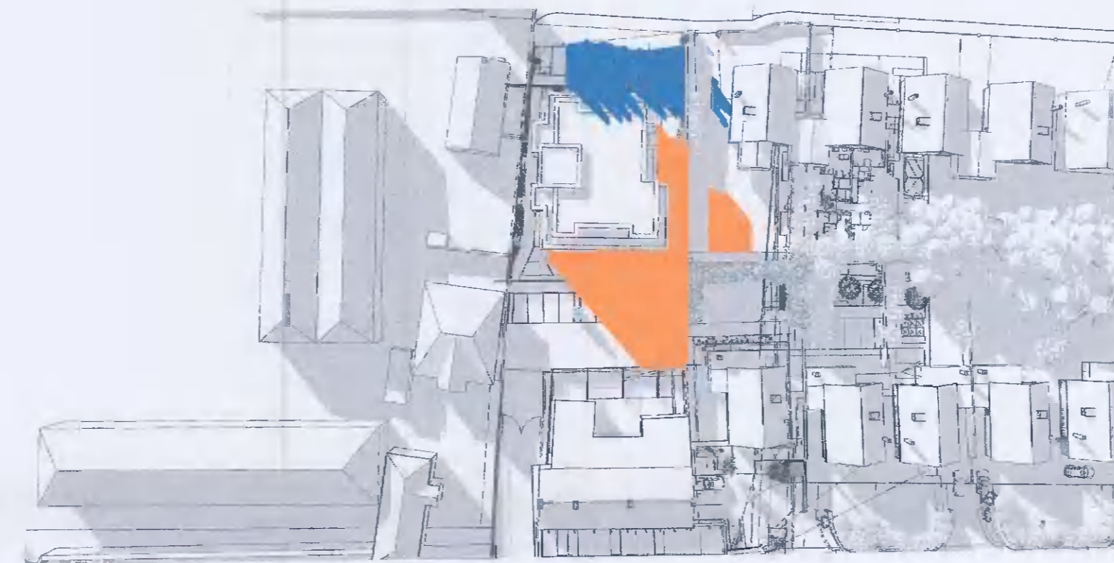
MARCH 21st - 9am (WITH PROPOSAL)