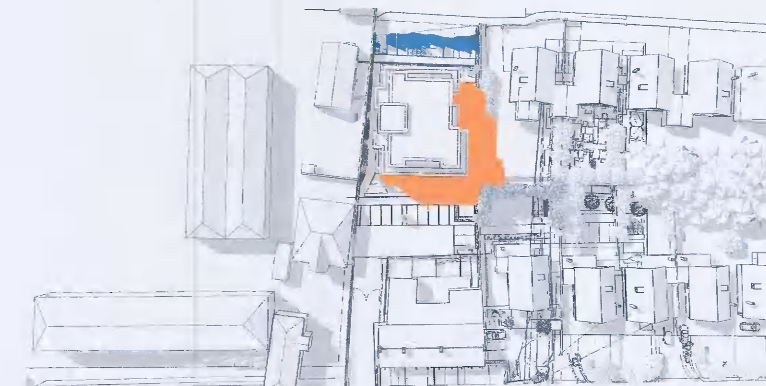
JUNE 21st - 9am (WITH PROPOSAL)