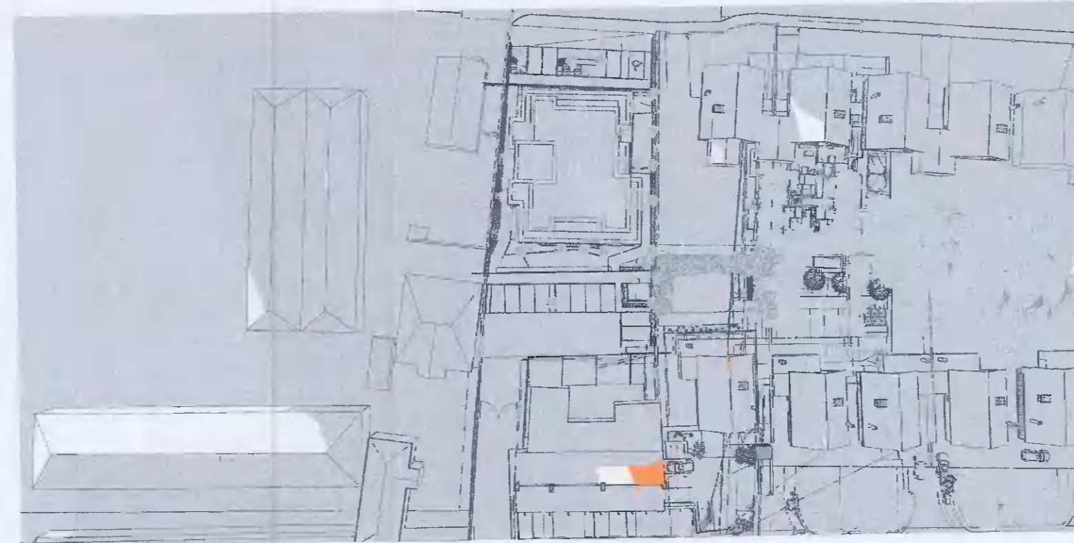
DECEMBER 21st - 9am (WITH PROPOSAL)