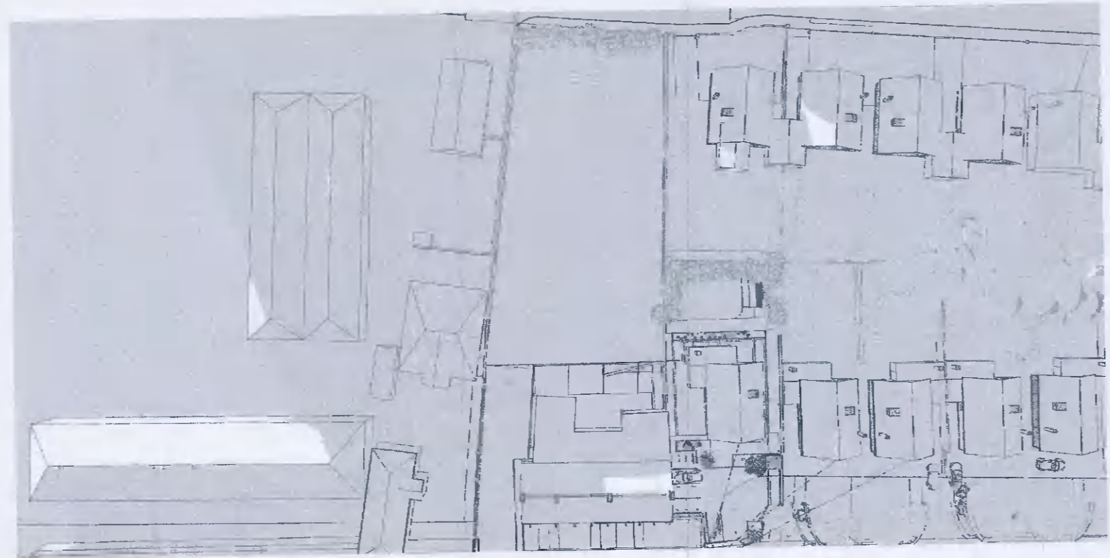
DECEMBER 21st - 9am (EXISTING)