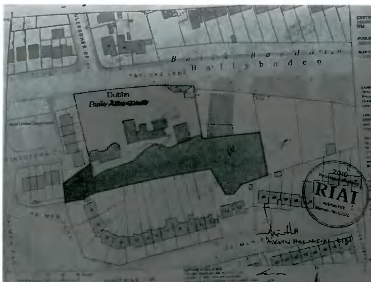
Land not currently owned by the applicant shaded blue

The application identifies that the site is gated, not in use at present, builders providers and with the most recent use being as a construction compound for the SDCC Green Route realignment of Taylor's Lane. It is our understanding that the possession of the rear part of the site is significantly open to question. The applicants appear to not hold title to a significant part of the site. For this reason alone, and given that no letter of consent was provided from the owners, we respectfully request the Council to invalidate the application. The extent of the land over which it is our understanding the applicant has no title to the lands is outlined below (shaded blue)