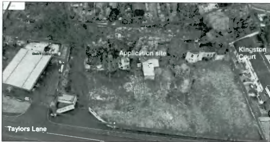
Aerial view from Taylors Lane looking towards subject site – Newbrook House in right hand side of image above

share a boundary with the subject site. There are 17 no. residential properties and their associated gardens to the south of the site. 16 no. properties (1-16 Palmer Park) share a boundary with the subject site as does No. 88 Pearse Brothers Park.