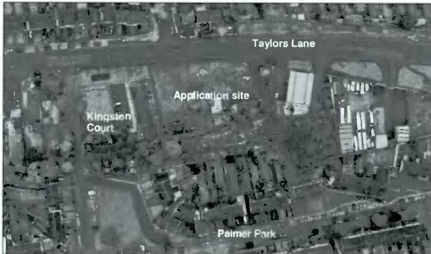
Aerial View of subject site

The subject site of c. 0.6388ha. includes Newbrook House (a Protected Structure) and its associated grounds that are located to the south of Taylor's Lane, Ballyboden. There are also a series of out buildings/sheds that may have formed part of the former paper mill within the subject site. Newbrook House dates from 18 th century and was associated with the paper mill that was located on the site. The site includes areas of hard standing, a watercourse (a mill race associated with the paper mill use), hedgerows and trees primarily located along the southern and western boundary. The existing buildings within the subject site are well set back from Taylors Lane.