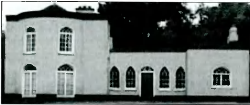
Newbrook House in c. 2006

The mass, scale and height of the proposed Nursing Home block which is linked to the Protected Structure via a glazed link will project the building line close significantly forward onto Taylors Lane and will as a result of the proposed built form overpower Newbrook House. The proposed location of the car parking associated with the Nursing Home directly in front of Newbrook House will also contribute to the erosion of the setting and character of the Protected Structure. Ultimately the proposals will alter the setting and character of the Protected Structure in a manner which is contrary to its protected status under the Planning & Development Act 2000 (as amended).