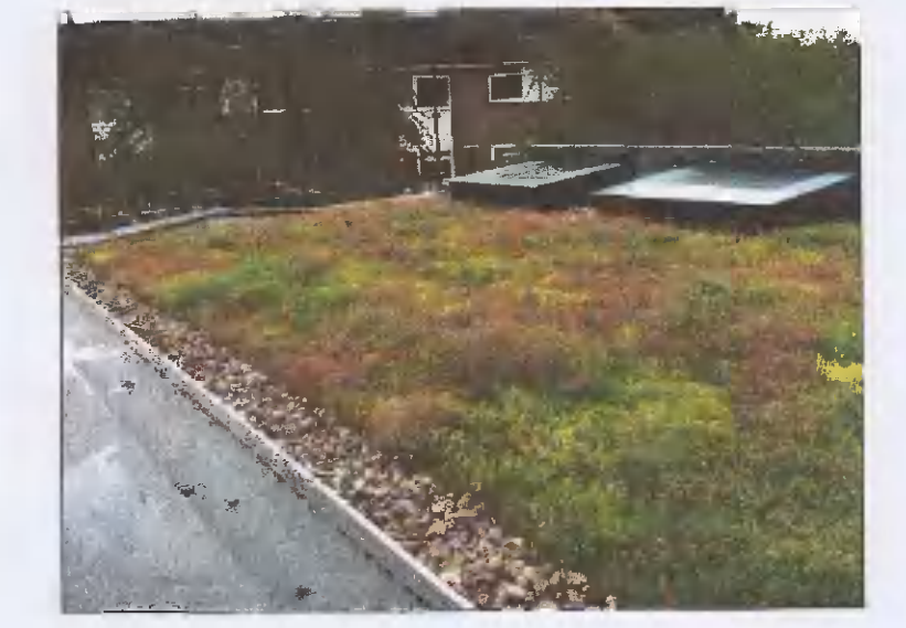
SEDUM GREEN ROOF SAMPLE IMAGE

Note: For Further Information on Green Roof Proposals, refer to SUDS proposal Report by GDCL Consulting Engineers.