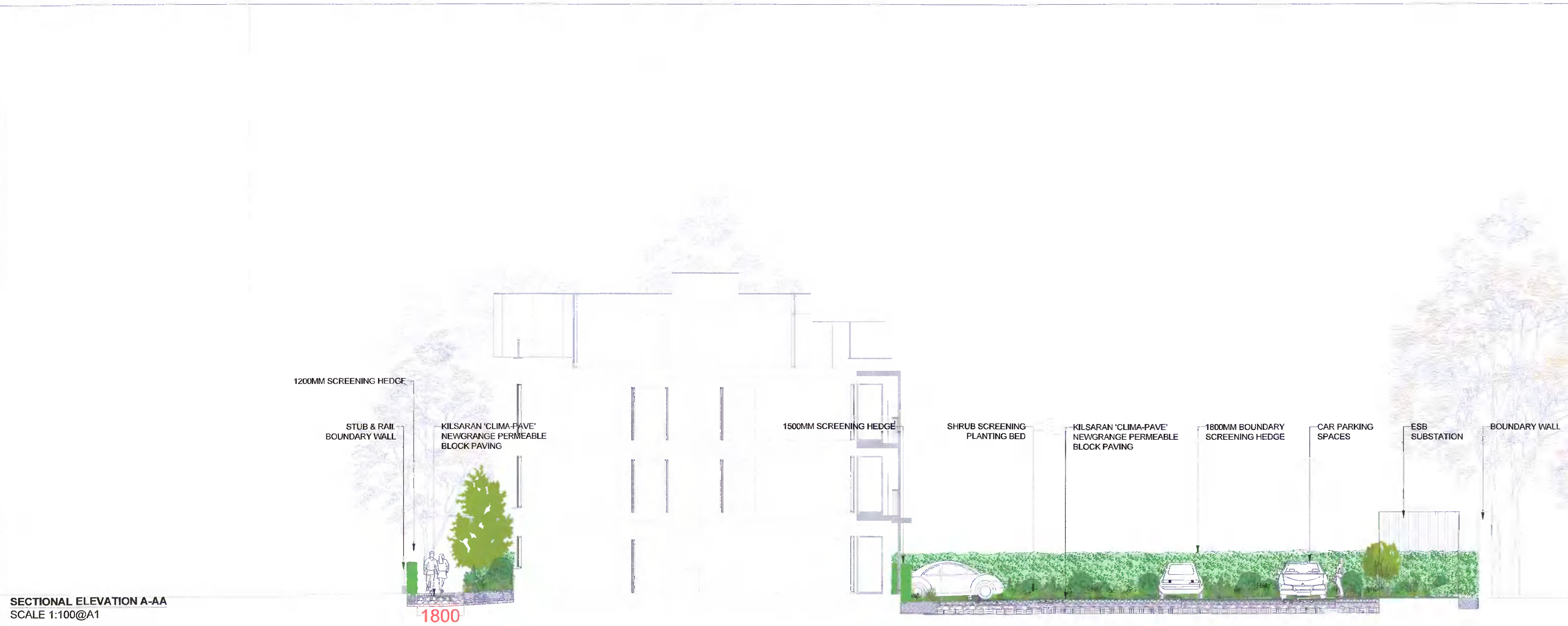
SECTIONAL ELEVATION A-AA SCALE 1:100@A1