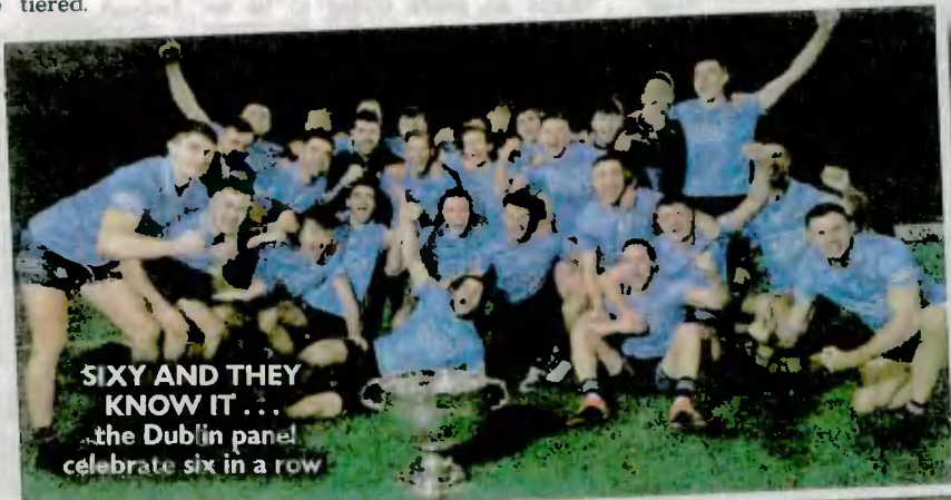
SIXY AND THEY KNOW IT . . . the Dublin panel celebrate six in a row

"Where is Gaelic games going to sit in all of these changing dynamics in terms of demographics on this island? It'll be very interesting."