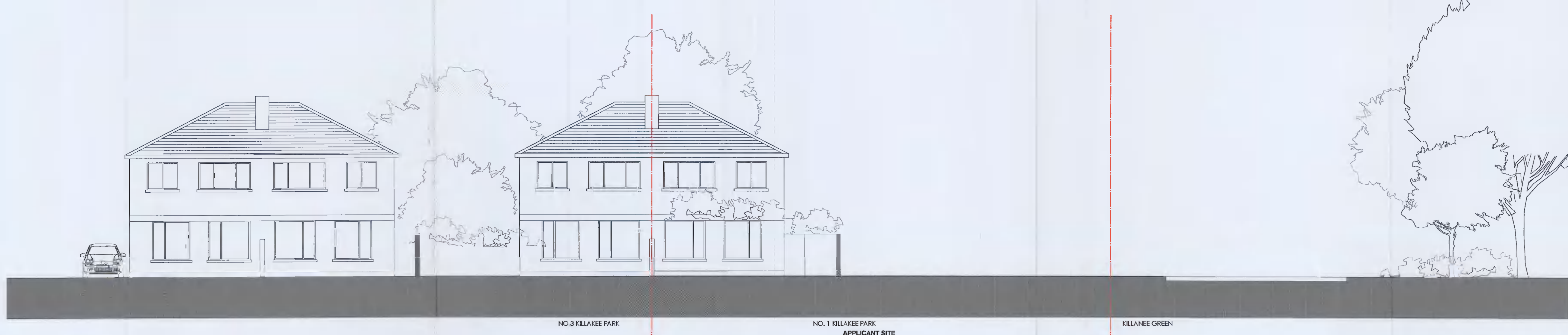
EXISTING [Rear garden] EAST ELEVATION SCALE: 1=100 @A1