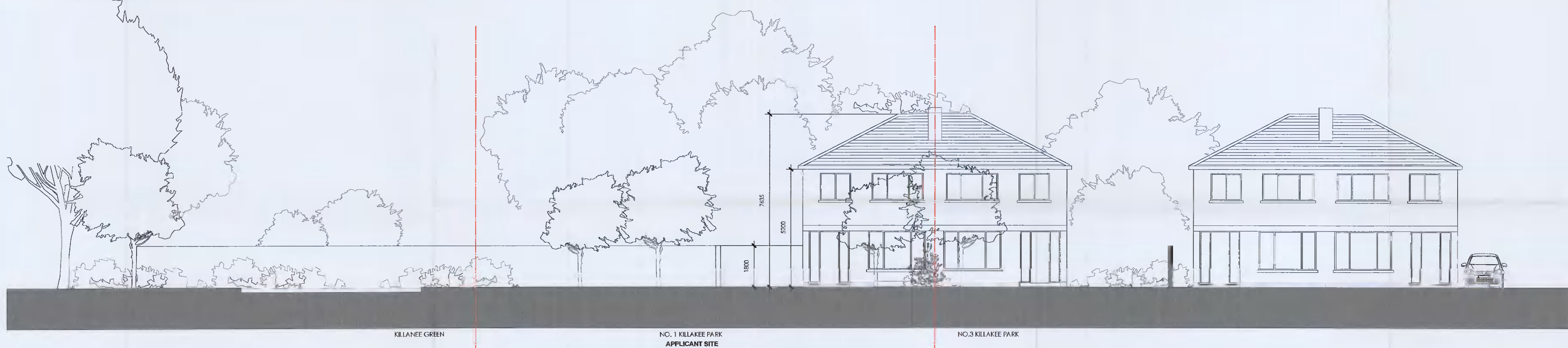
EXISTING WEST (Front garden) ELEVATION SCALE: 1=100 @A1