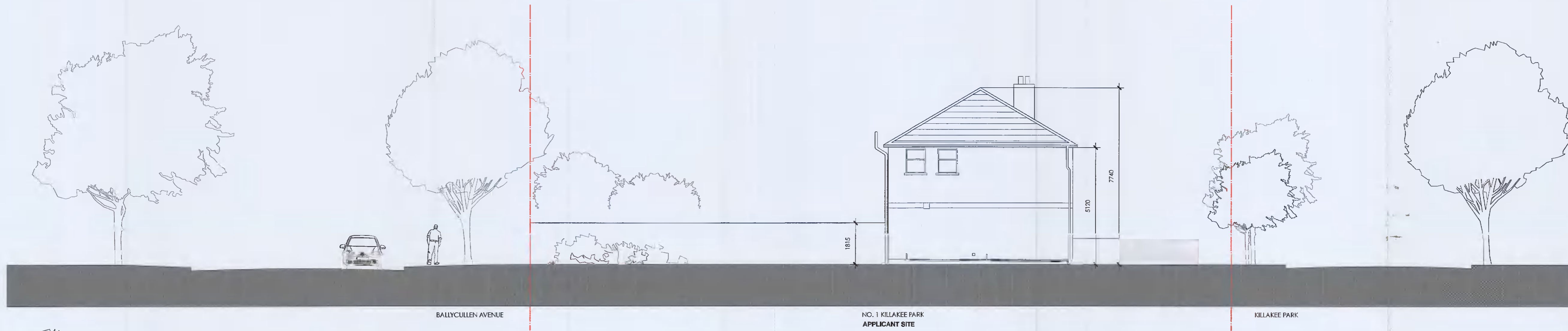
EXISTING NORTH ELEVATION (To park) SCALE: 1=100 @A1