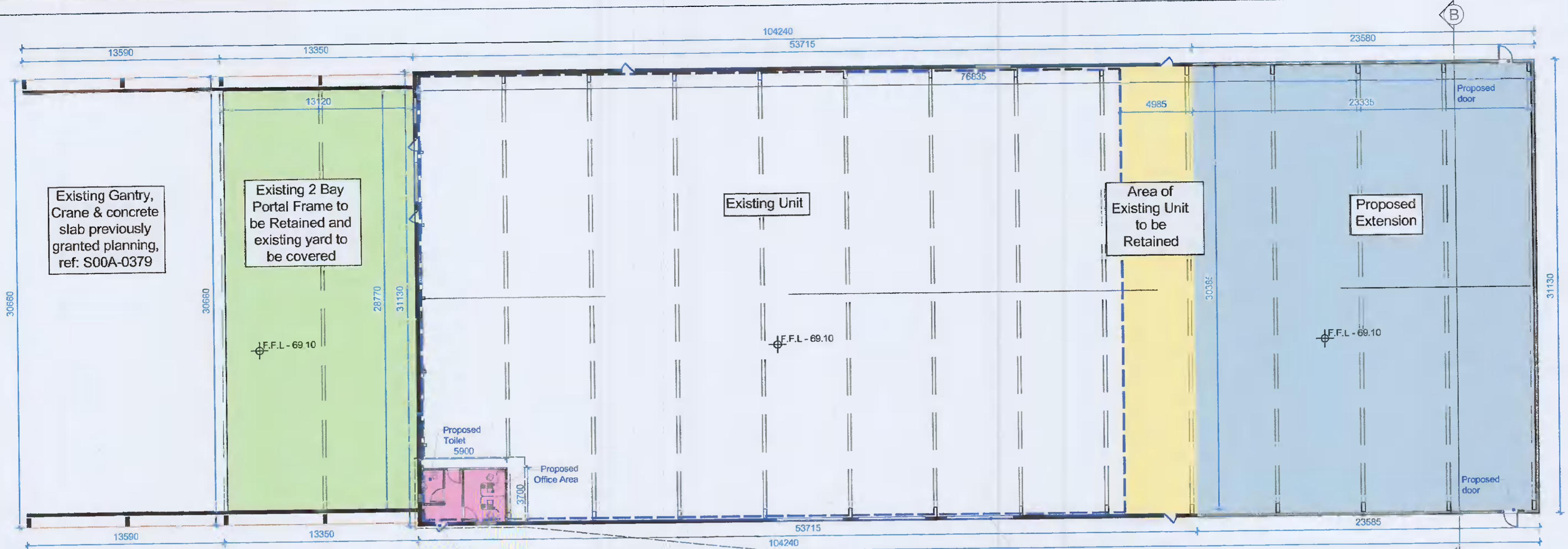
01 Proposed Ground Floor Plan 200 1:200