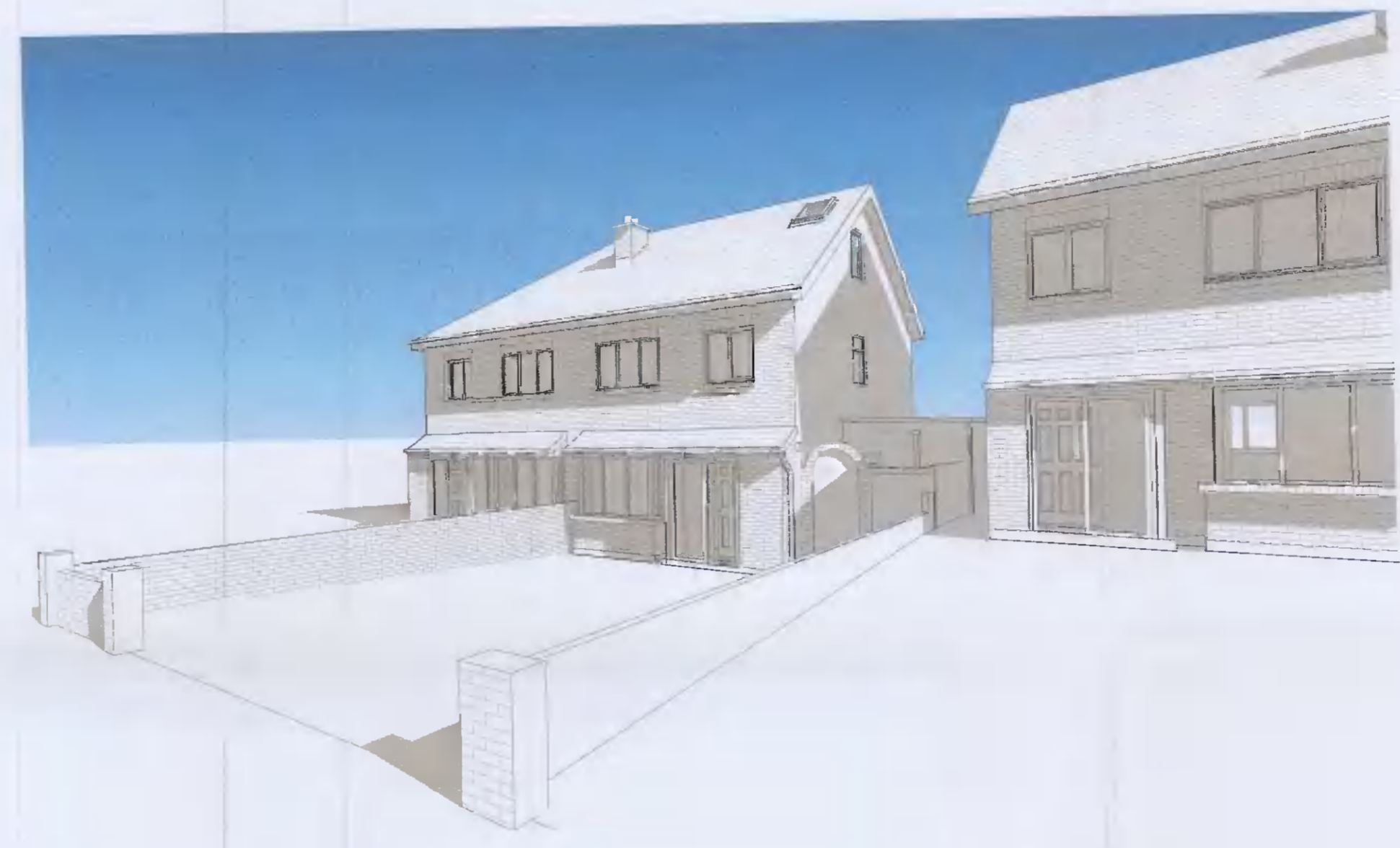
2 PROPOSED FRONT PERSPECTIVE ELEVATION PL 003 SCALE: