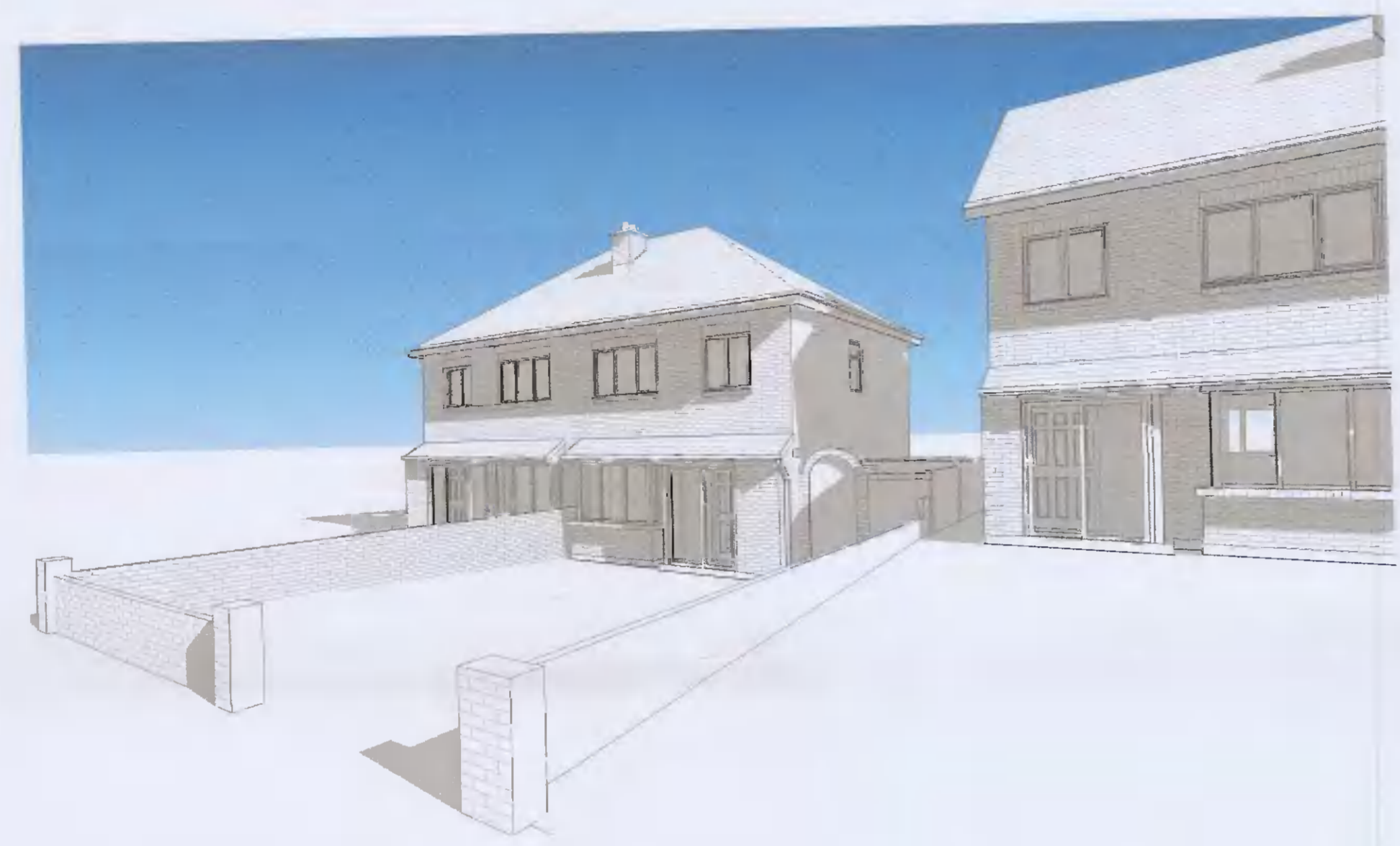
1 EXISTING FRONT PERSPECTIVE ELEVATION PL 003 SCALE: