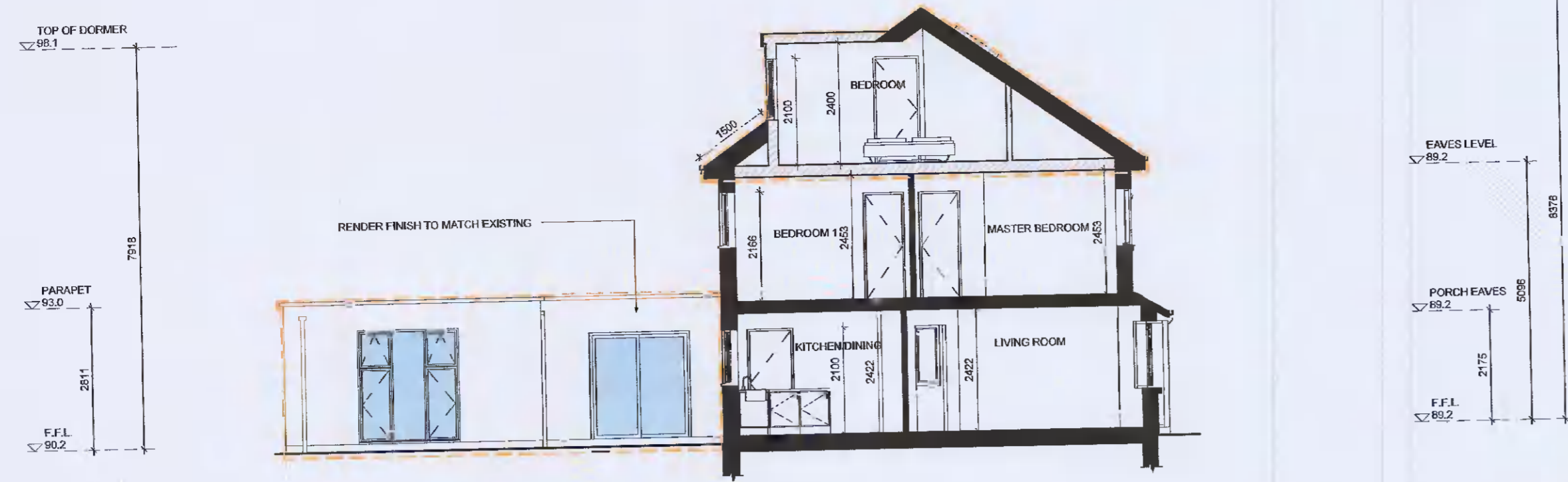
3 PROPOSED SECTION A-A PL 003 SCALE: 1:100