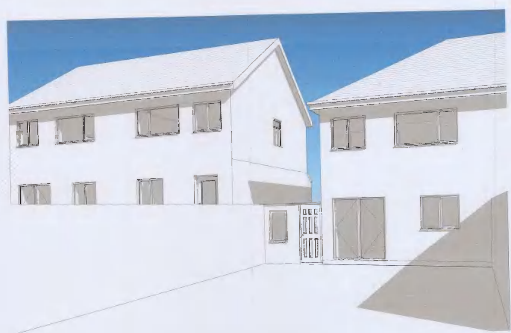
5 EXISTING REAR PERSPECTIVE ELEVATION PL 003 SCALE: