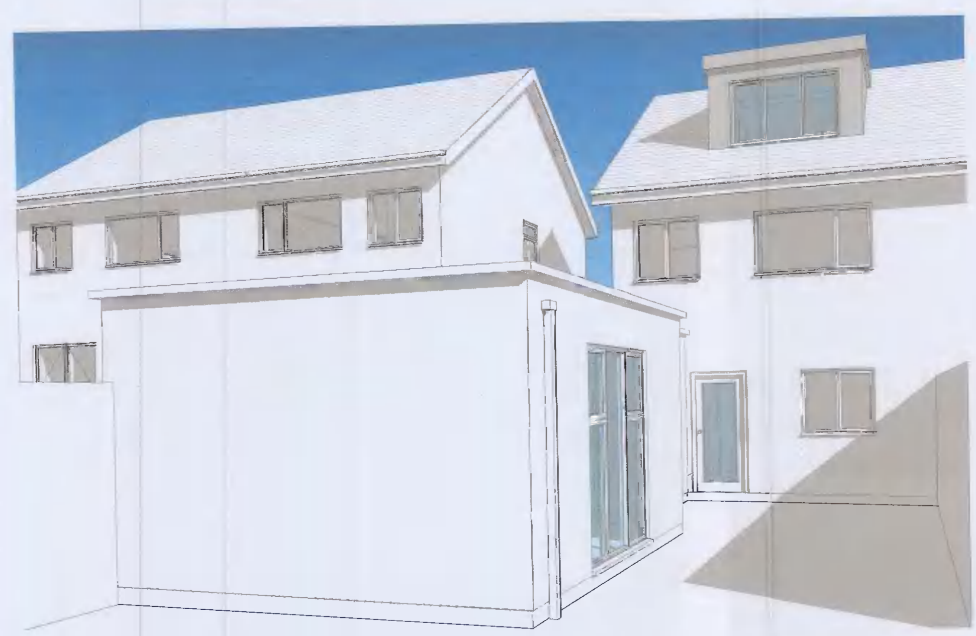
6 PROPOSED REAR PERSPECTIVE ELEVATION PL 003 SCALE: