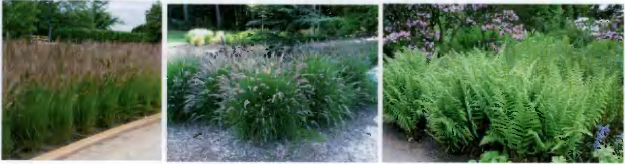
Figure 4– Precedent Image Screening Planting

Soft buffer planting of ornamental grasses and ferns has been selected to screen and soften building edges, while maintaining a sophisticated architectural aesthetic.