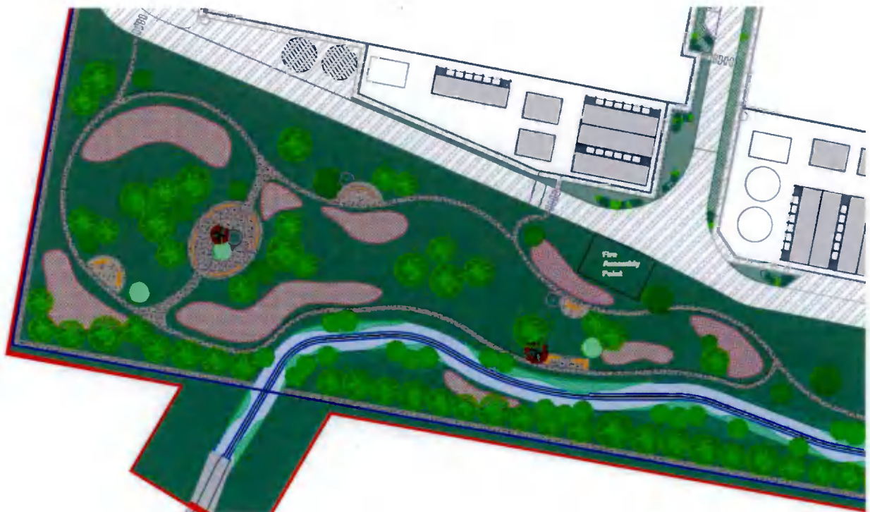
Figure 3 --Proposed Pocket Park Plan (See DB080-MA-LS-XX-DR-L-PLNT-1052 for details)