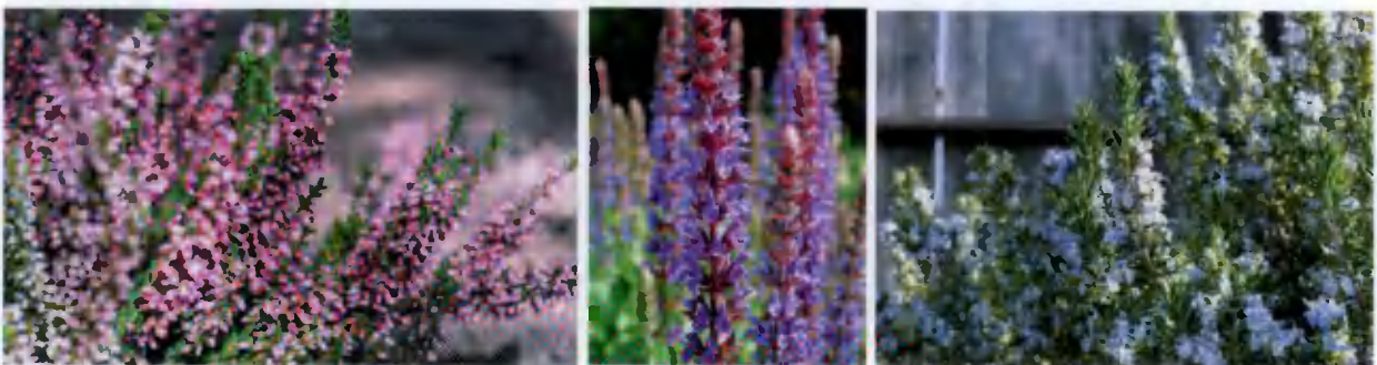
Figure 6– Precedent Decorative Planting

Decorative planting in shades of purple and pinks is provided through shrub planting. Lavender, Rosemary, and Heather provide colour, scent, and interest through structure while not in flower.