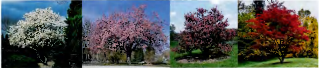
Figure 7– Feature ornamental trees with year-round interest

Ornamental trees create a feature element at the center of the pocket park evergreen magnolia provides flower and year round lush foliage, Japanese maple provides vibrant colour in the autumn, while the flowering cherry takes center stage in the spring.