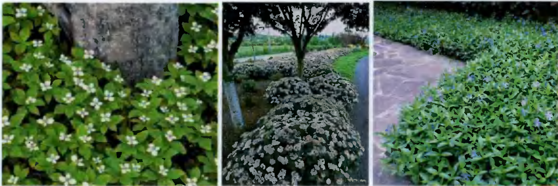
Figure 5– Precedent Ground cover Planting

Ground cover planting has been selected for planting under tree canopies and around parking spaces. Planting such as Viburnum Davidii, dogwood and periwinkle will grow low to the ground and well in shade, while providing flowering interest in a colour pallet of white, pink and purple.