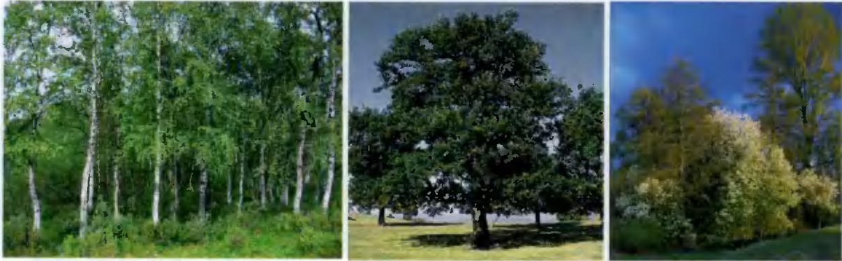
Figure 9– Native Irish Trees

The additional native woodland planting provided on site, will consist of Birch, Oak, Field Maple and Bird cherry. This will provide additional screening as well as diversifying the tree species in this area (currently predominantly Ash, which is being badly affected by dieback).