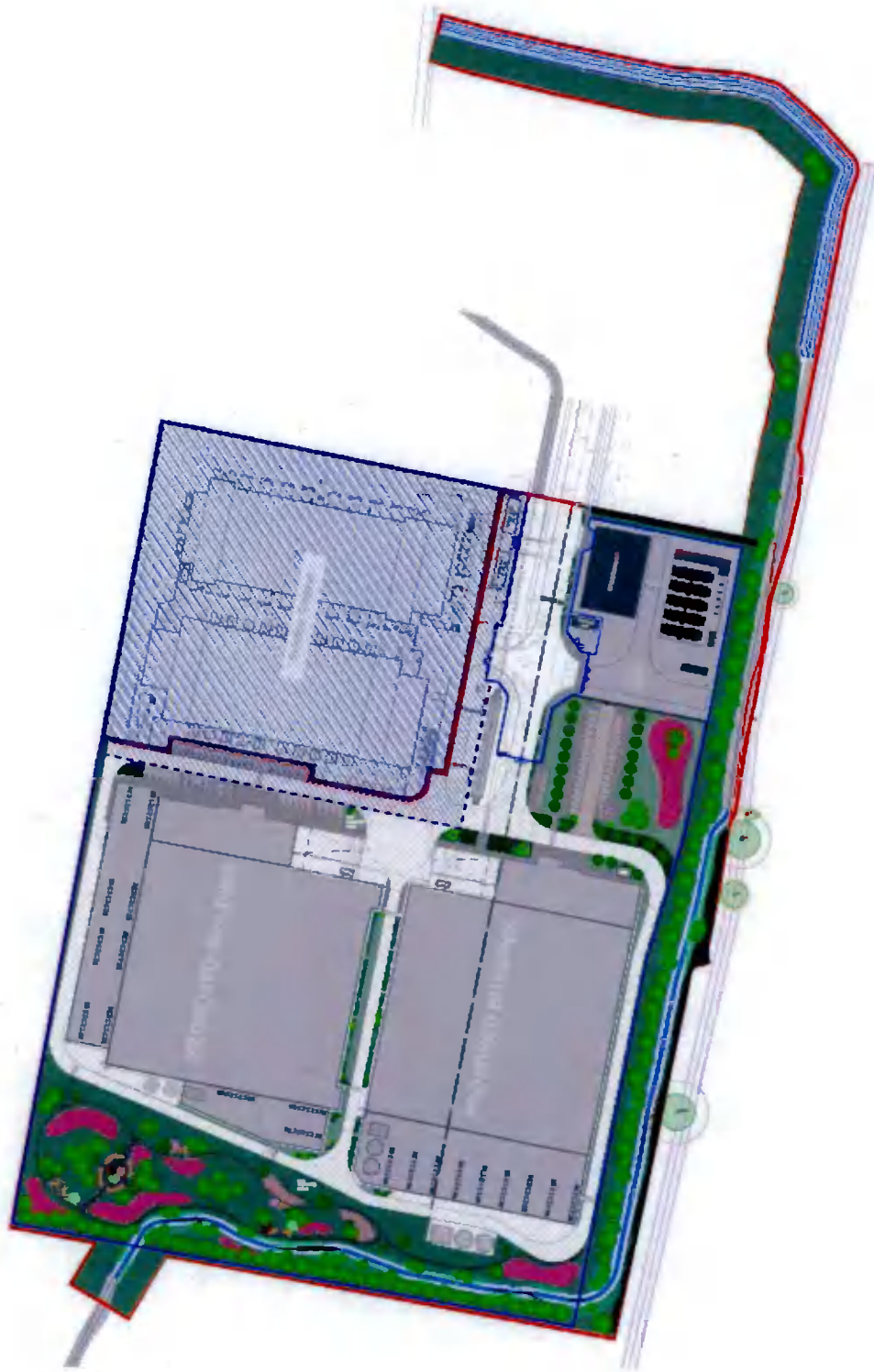
Figure 2 –Proposed Landscape Plan (See IEDUBZZ-STE1-E0-MAL-LA-L-91001 for details)