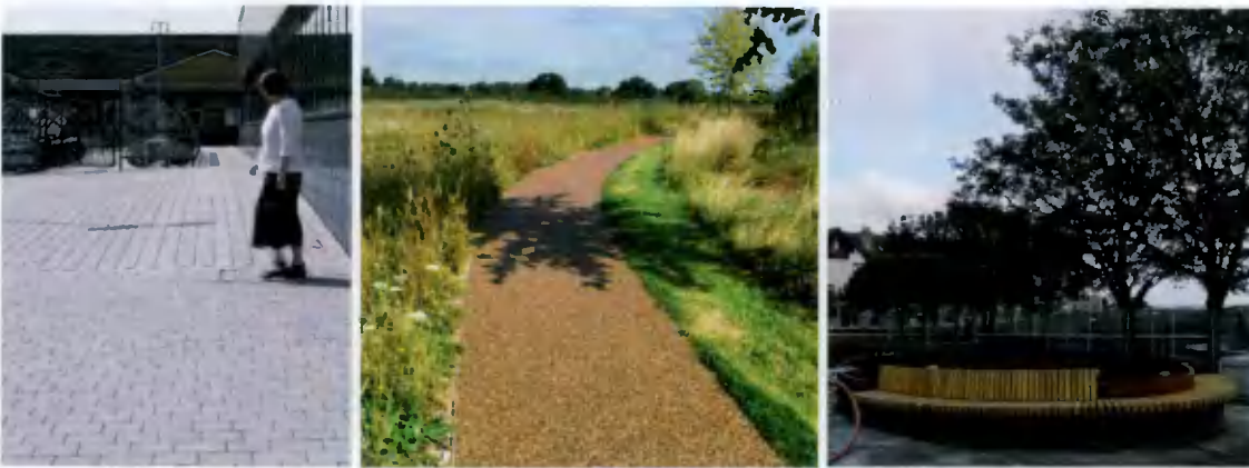
Figure 10- Precedent Image Hard Landscape Materials (Permeable paving, Buff Gravel Path, M&A bespoke curved bench @ The Green, Malahide)

The hardscape materials were selected to complement the function of spaces and contribute to sustainable urban drainage. Permeable paving is used in the parking bays and pedestrian zones. Hard surfacing within the greened area is used only to provide access paths and seating zones and consists of an understated buff colour self-binding gravel path to compliment the natural surroundings. Bespoke timber benches are designed to fit seamlessly with the design, curved and L shaped benches create more social spaces, while single rectangular benches allow for a more private space.