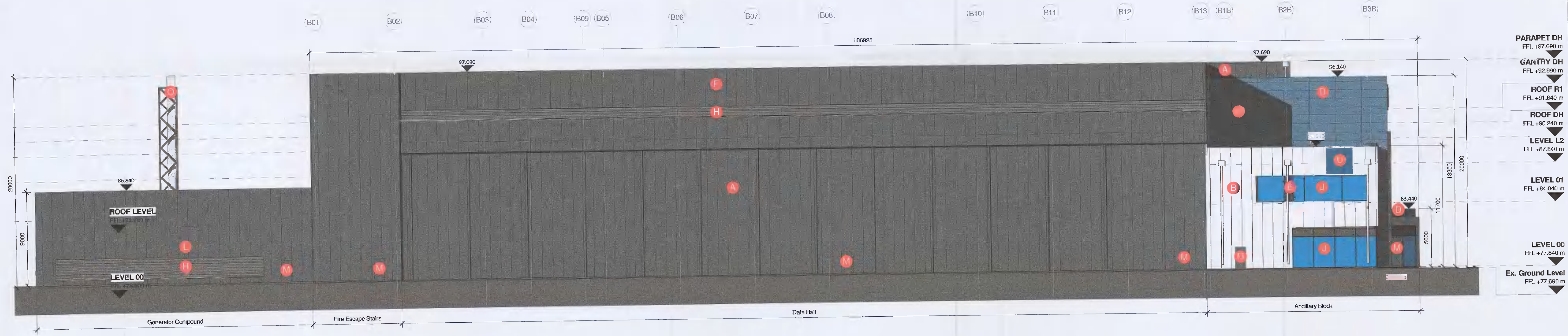
2 04051 DUB16 East Elevation 1 : 200