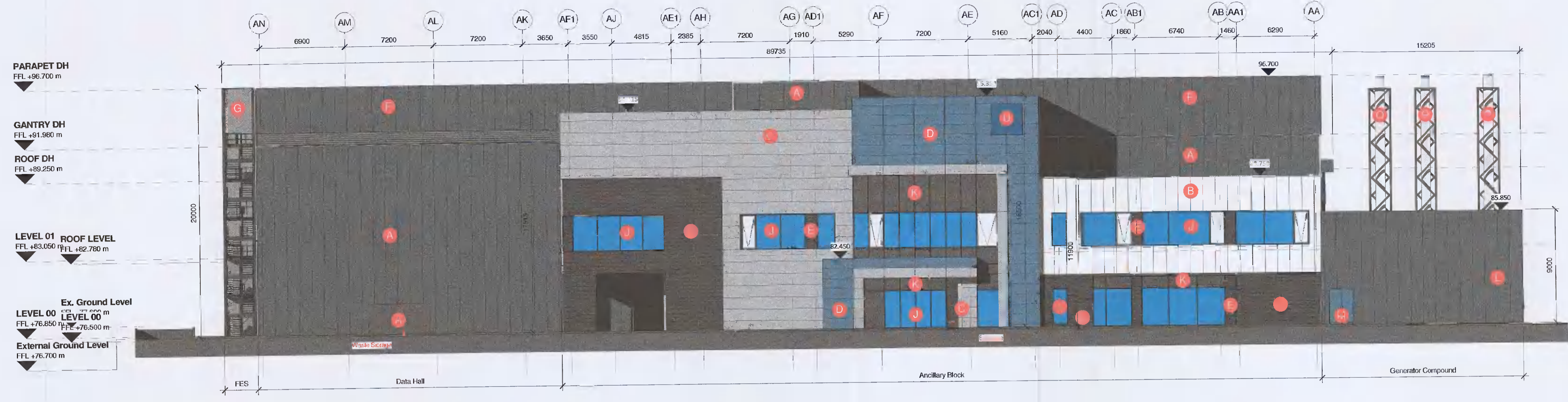
1 04012 DUB15 - North Elevation 1 : 200

All dimensions to be checked on site. Figure dimensions take preference over scale dimensions. Any errors or discrepancies to be reported to the Architect. This drawing may not be valid or modified by the recipient. Copyright and ownership of this drawing is vested in RKD Architects, whose prior written consent is required for its use, reproduction or for publication in any third party. All rights reserved by the law of copyright and by international copyright conventions are reserved to RKD Architects and may be protected by court proceedings for damages and/or injunctions and costs. RKD Architects Quality Management Systems are certified to ISO 9001:2015.