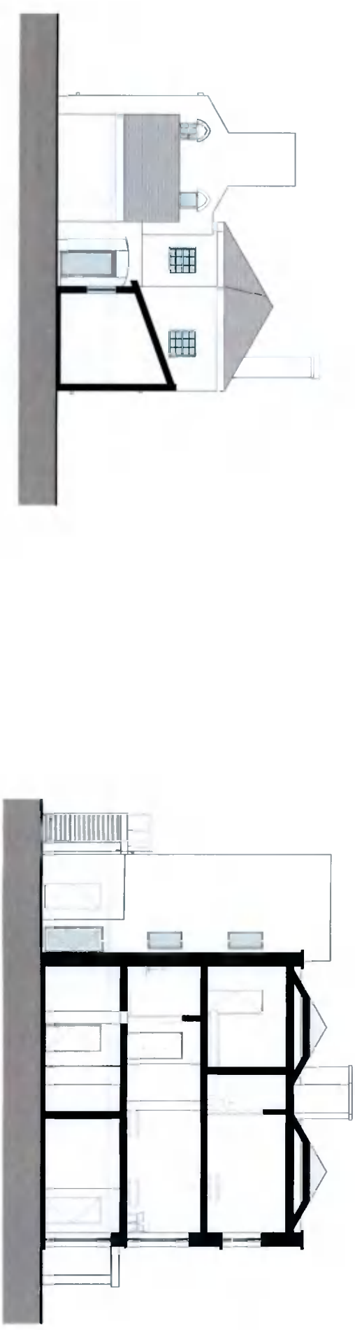
WEST ELEVATION & SECTION AA SCALE = 1:200