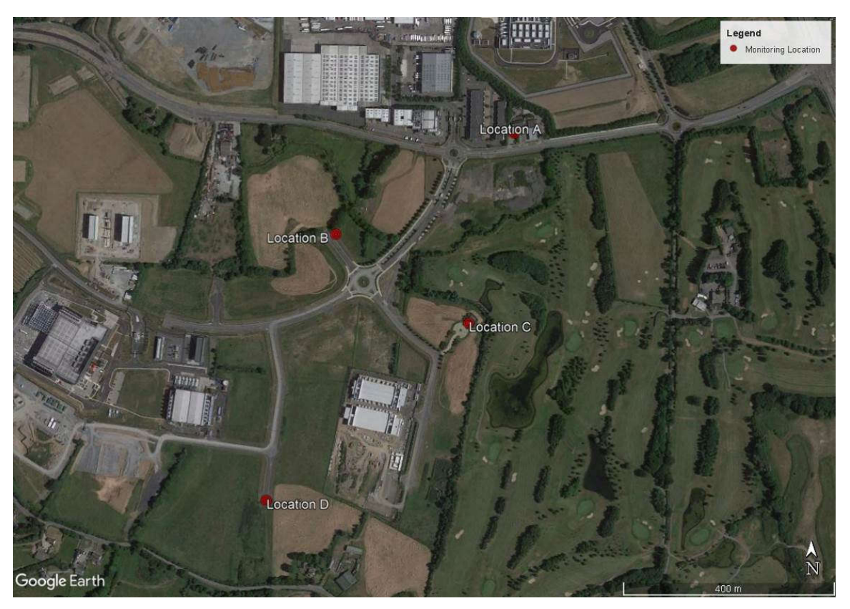
Figure 11-2: Noise Monitoring Locations

Figure 11-2 illustrates the approximate location of the noise monitoring locations being considered here.