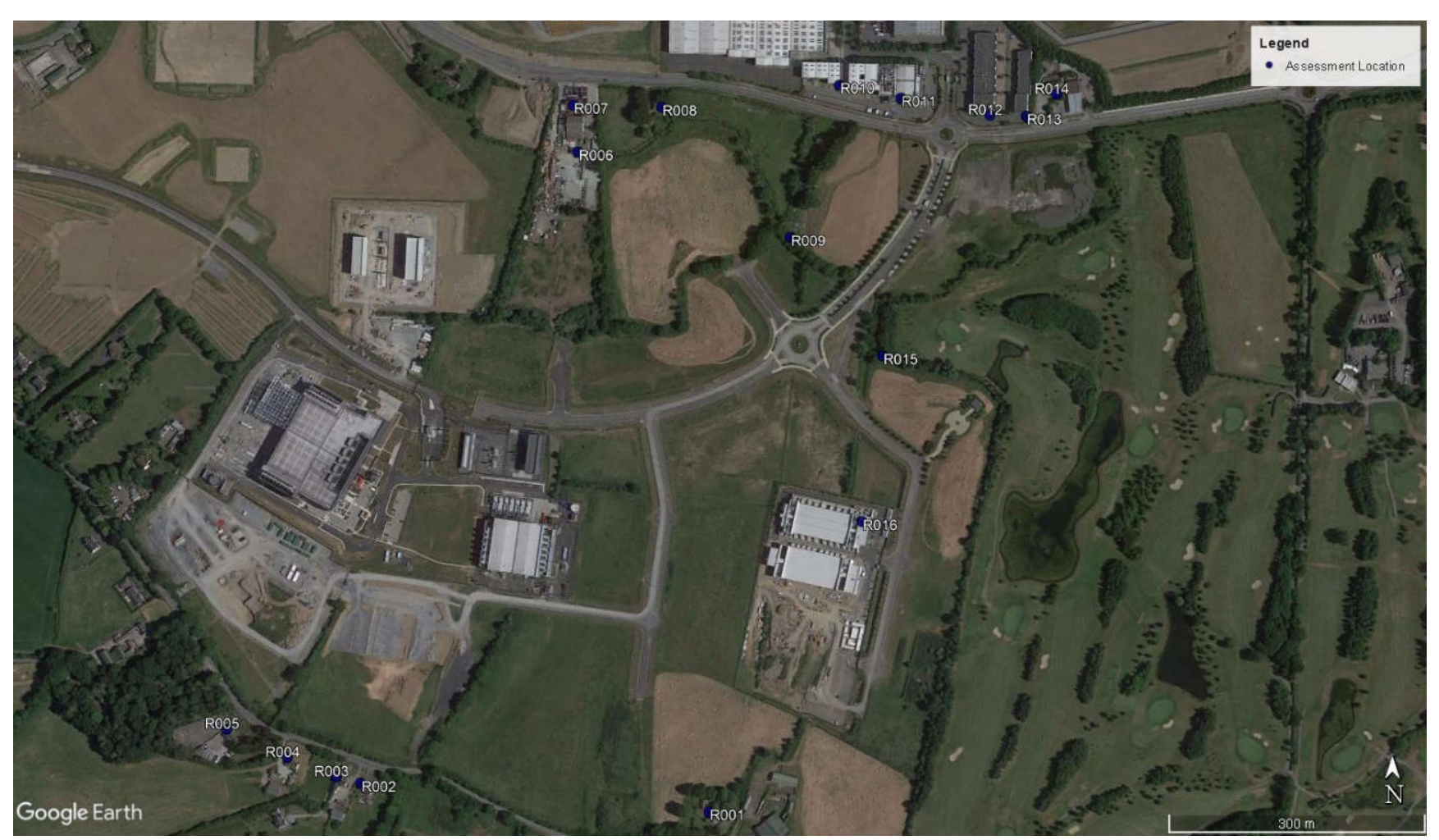
Figure 11-4: Noise Assessment Locations

The following noise sensitive locations have been considered as part of this assessment.