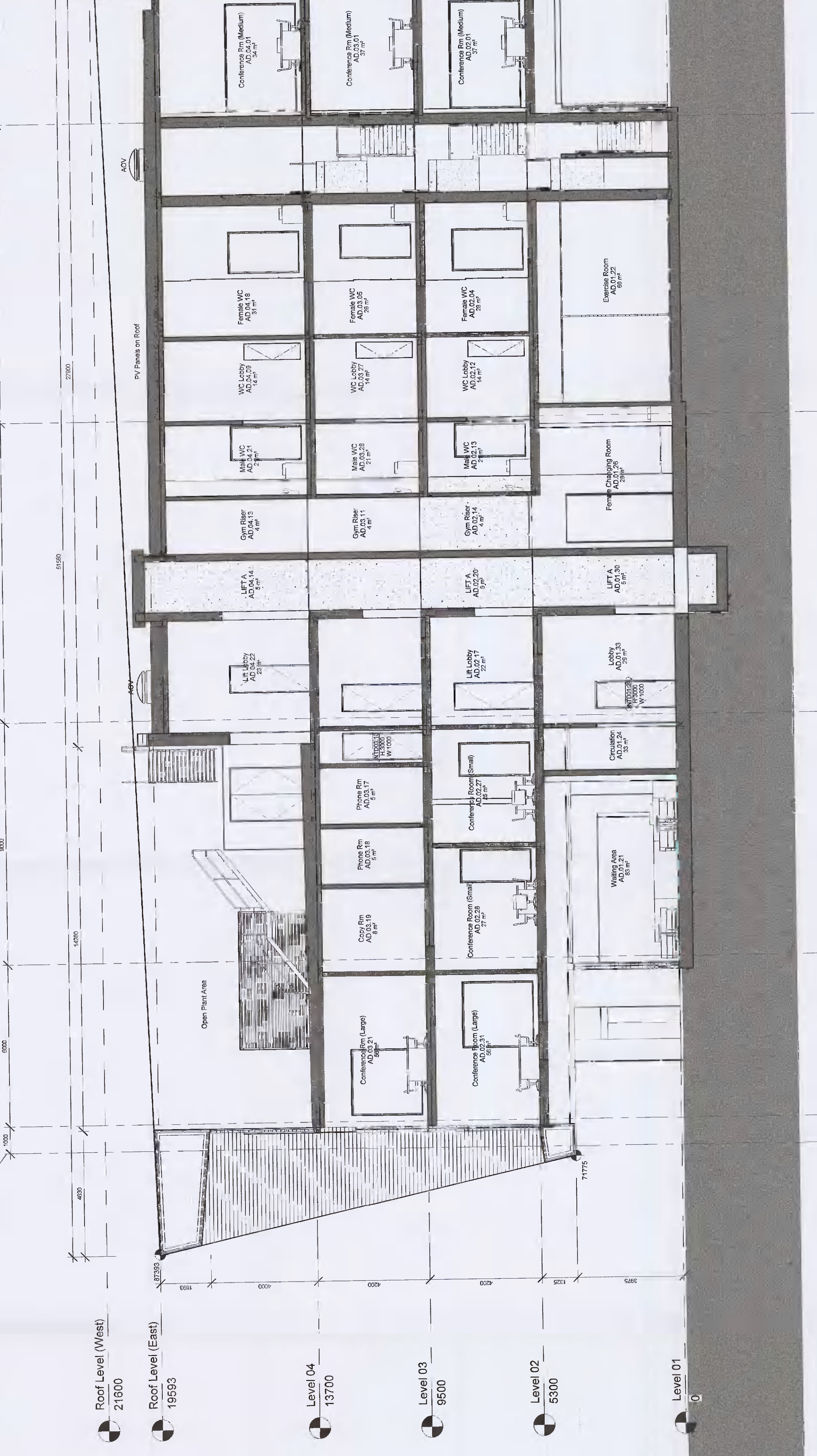
1 SECTION D-D 1:100