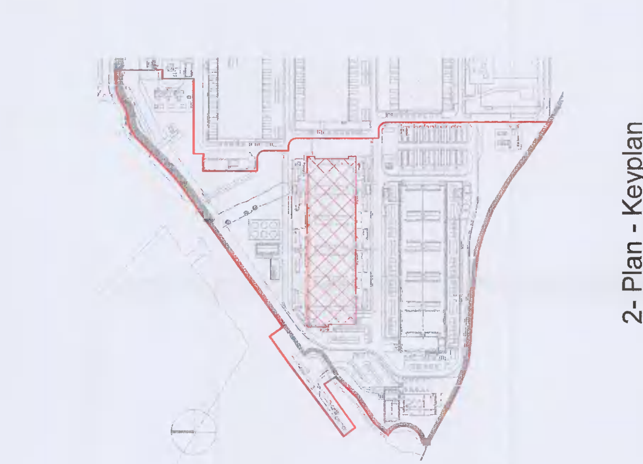
2- Plan - Keyplan Scale 1:5000