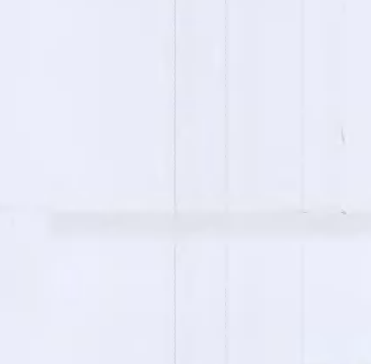
2 Proposed - Overall Site Section B-B - Part 1 1:200