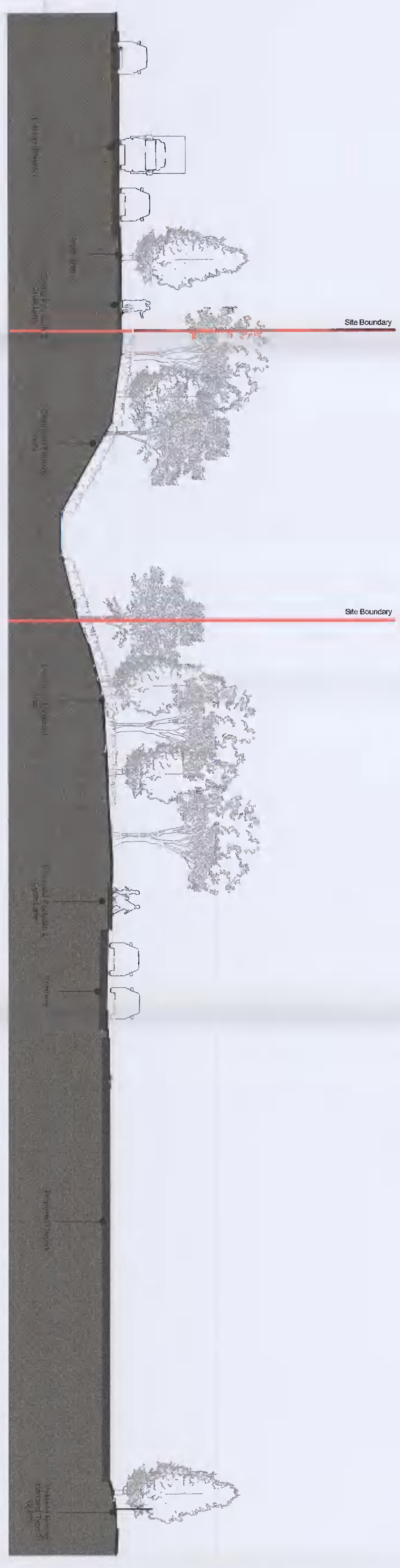
2 Proposed - Boundary Section E-E (Through North Carpark) 1:200