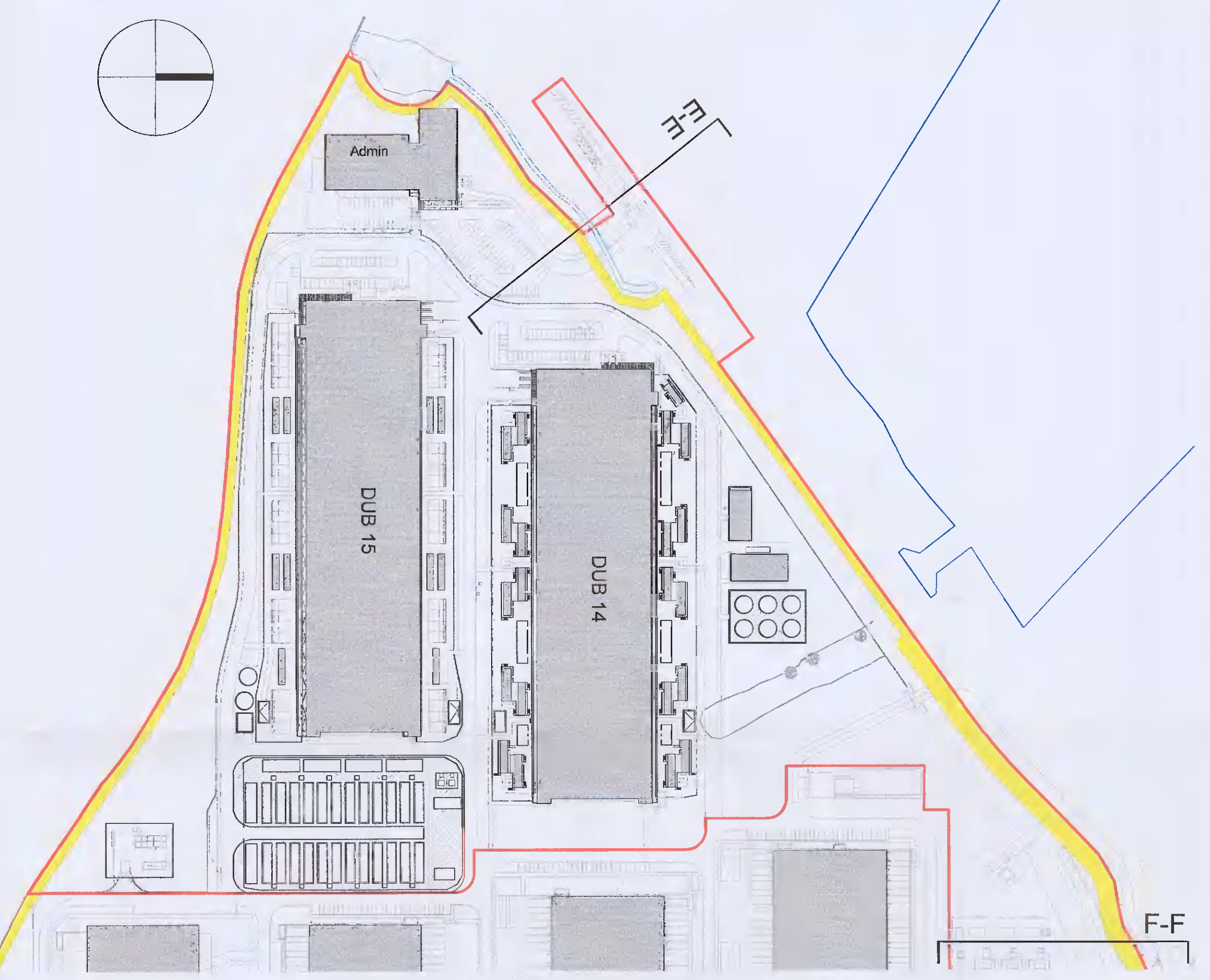
5 Masterplan Key 1:2000

SUBMITTED FOR REFERENCE ONLY - NO CHANGE PROPOSED FROM APPROVED SECTION F-F ABOVE AS PER REG. REF. SD20A10283