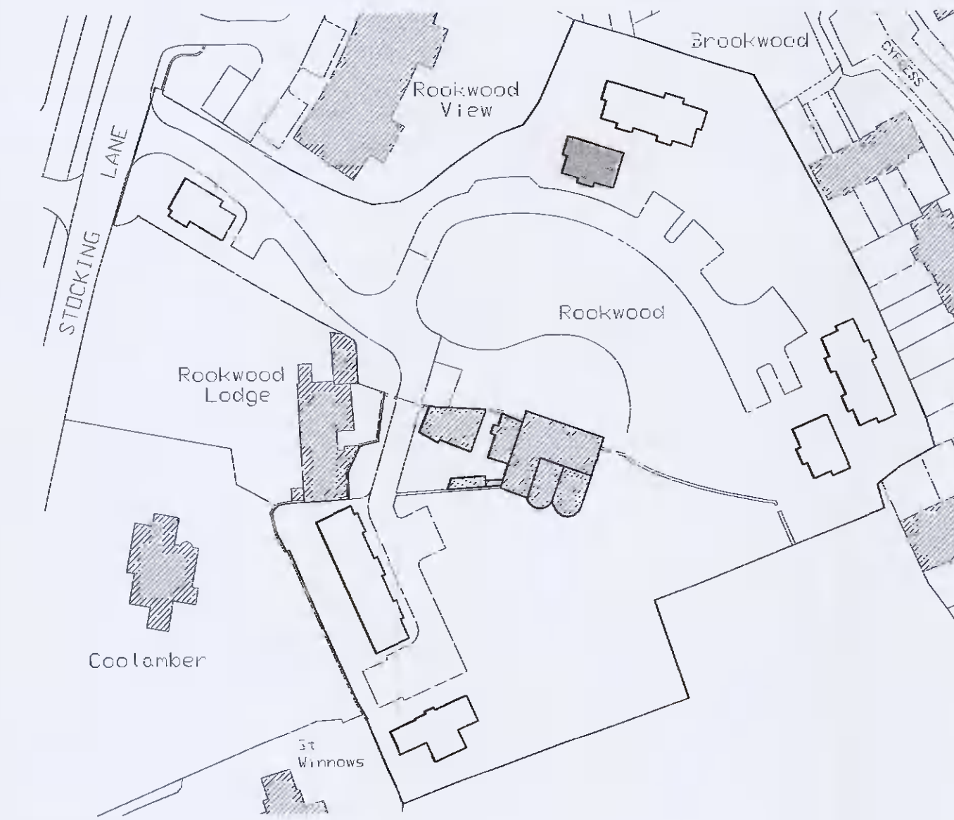
KEY PLAN (nts)