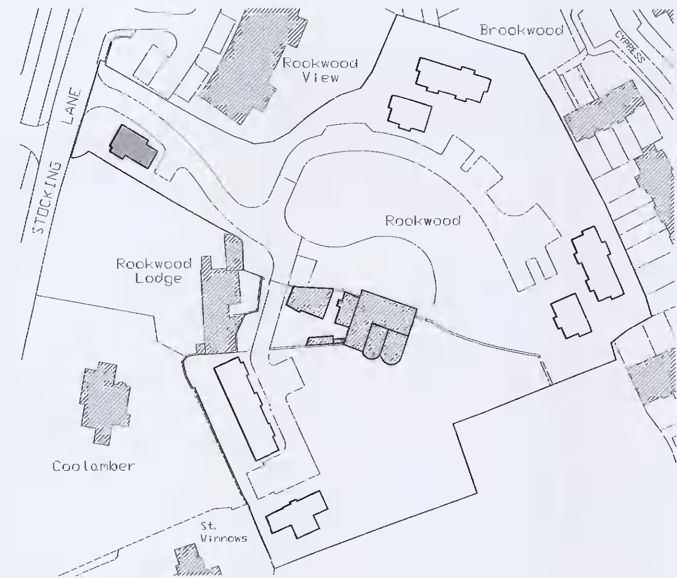
KEY PLAN (nts)