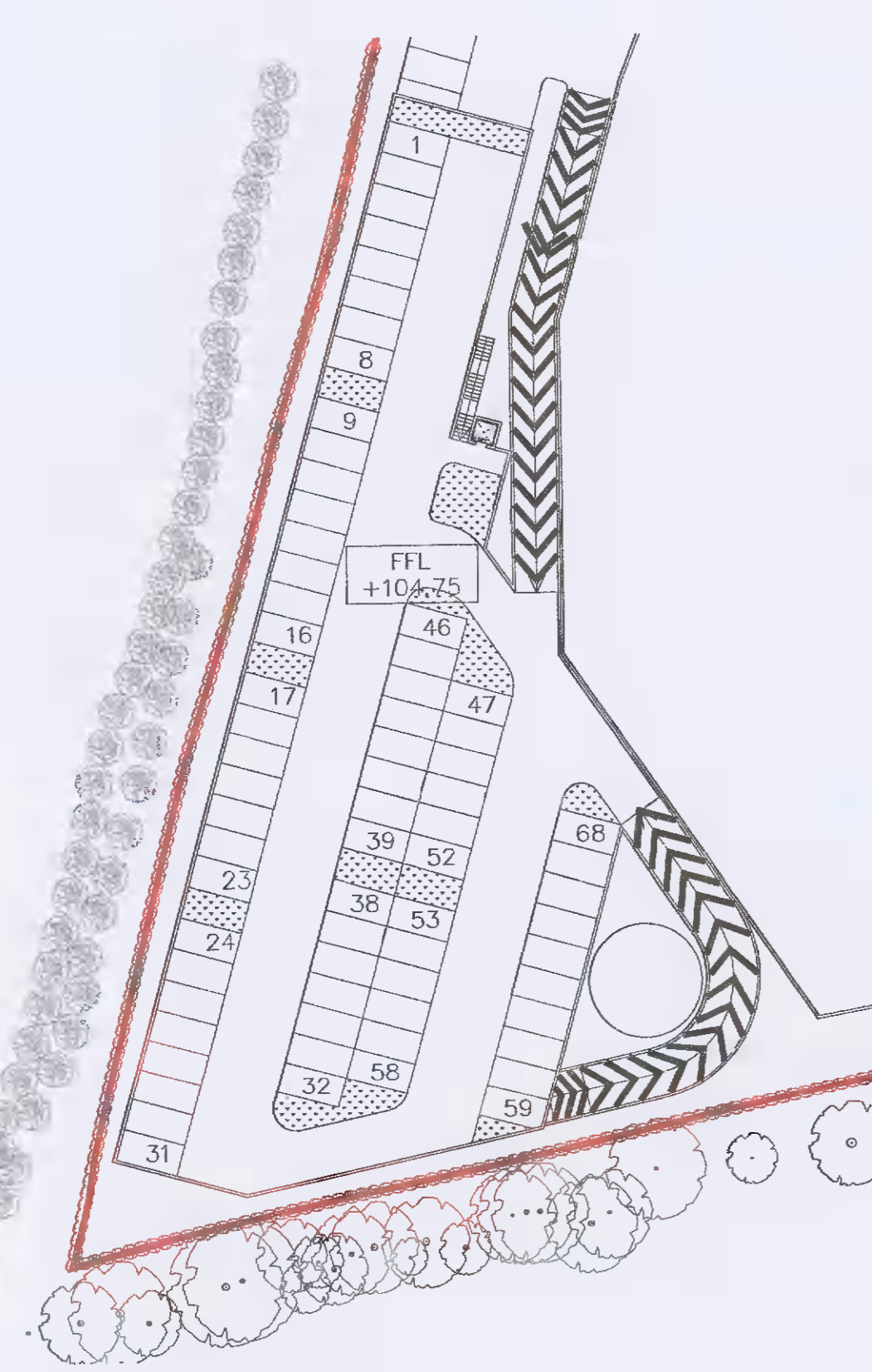
Upper Carpark Level