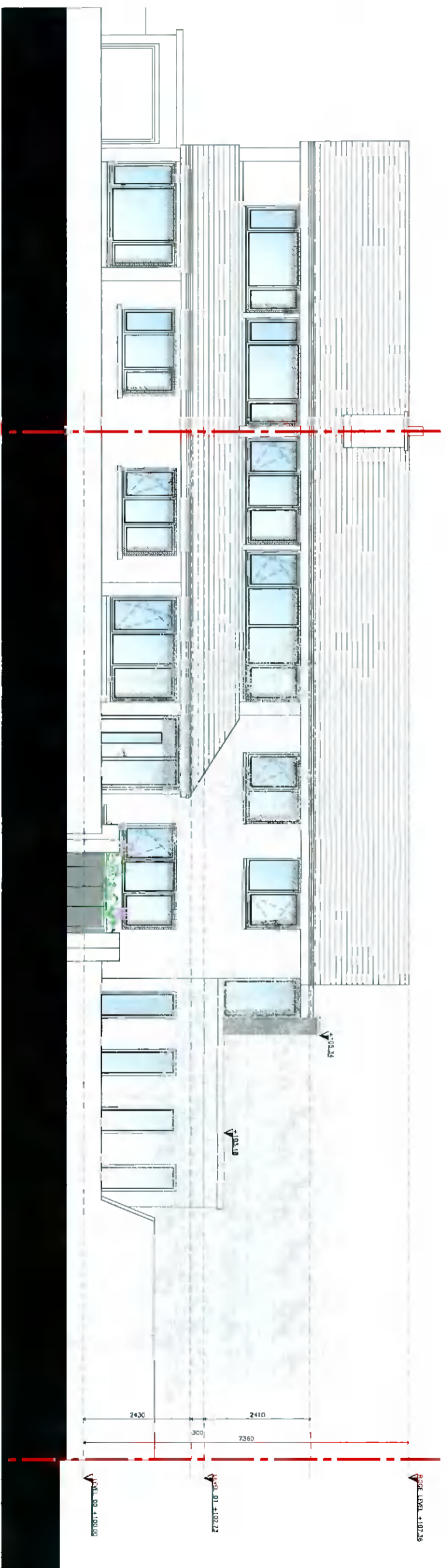
PROPOSED CONTIGUOUS ELEVATION SCALE 1:50 @ A1, 1:100 @ A3

DO NOT SCALE FROM THIS DRAWING. USE INQUIRY DIMENSIONS IN ALL CASES. VIEW IS RENDERING BY SITE AND EXISTING AND PROPOSED TO BE THE ARCHITECT'S LIABILITY. THIS DRAWING IS COPYRIGHT AND NOT TO BE REPRODUCED WITH THE ARCHITECT'S PERMISSION.