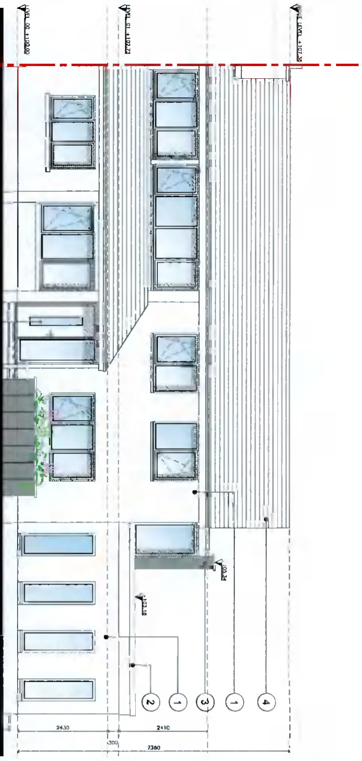
PROPOSED FRONT ELEVATION (EAST) SCALE 1:50 @ A1, 1:100 @ A3

DO NOT SCALE FROM THIS DRAWING. USE PROVIDED DIMENSIONS IN ALL CASES. VIEW'S DRAWING IS TO BE USED FOR PERMITS AND CONSTRUCTION. IT IS THE ARCHITECT'S RESPONSIBILITY TO VERIFY ALL DIMENSIONS AND CONDITIONS. THE ARCHITECT'S INTENTION IS TO PROVIDE THE DRAWING'S COMPLETION AND NOT BE RESPONSIBLE FOR THE ARCHITECT'S INTENTION.