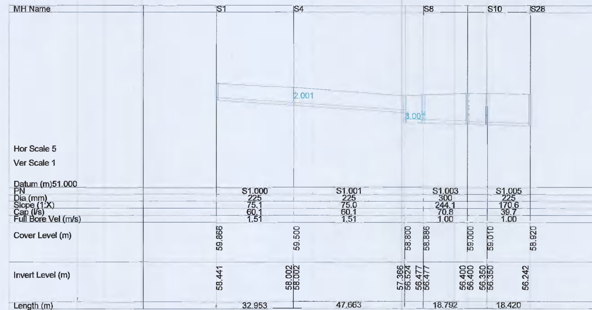
SURFACE WATER NETWORK S1.000 - S1.005