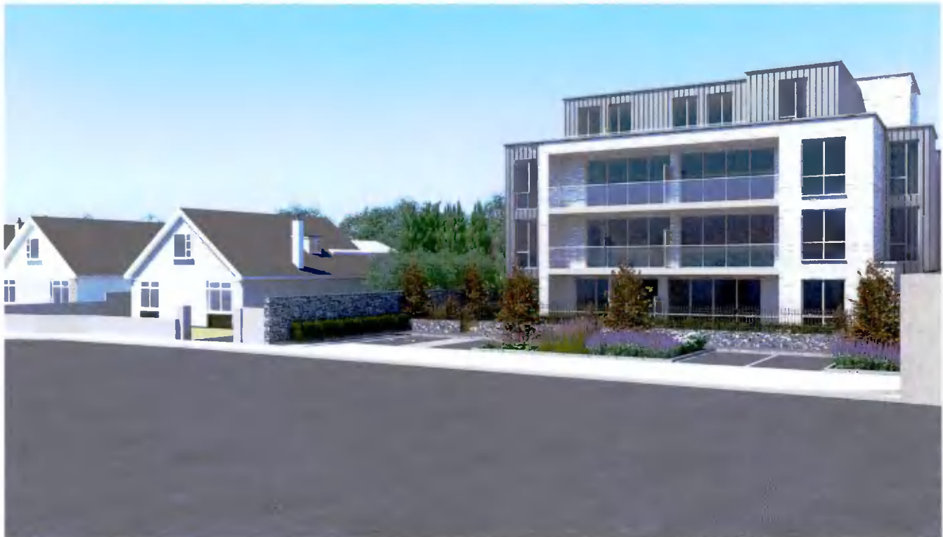
Reference Image 8: Proposal (View of subject site from Ardeevin Drive)