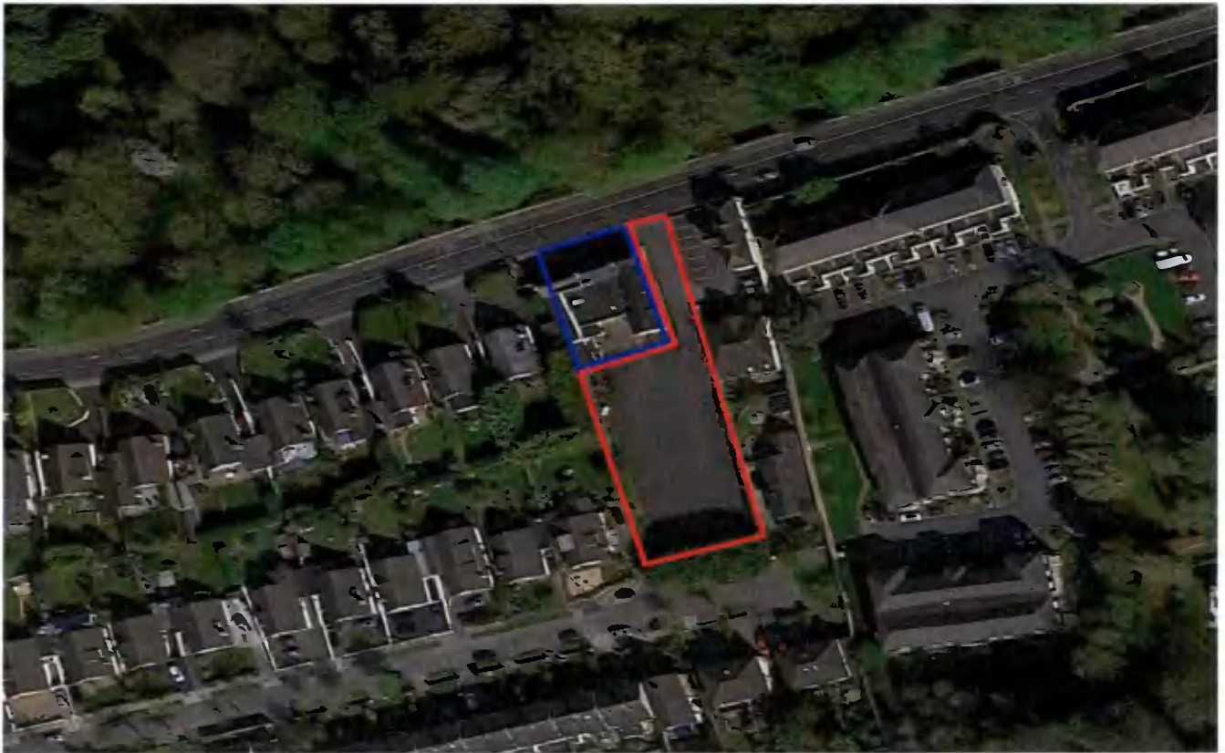
Reference Image 2: Aerial View of Subject Site Ball Alley House – Site Outlined in Red