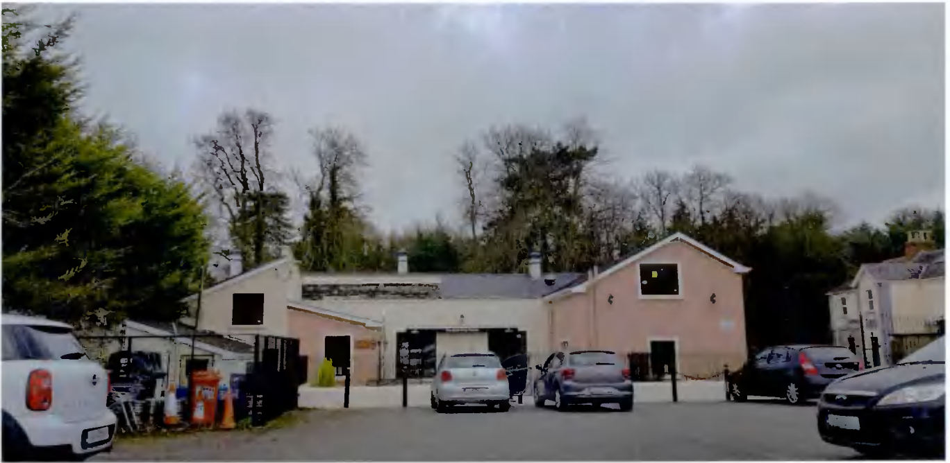
Reference Image 4: Existing Site Photograph (View of Ball Alley House as seen from Subject Site (Car Park))