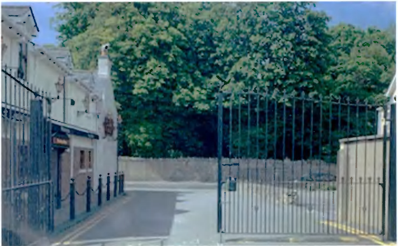
Reference Image 5: Existing Site Photograph (View of access to Subject Site directly from the Leixlip Road (R835))