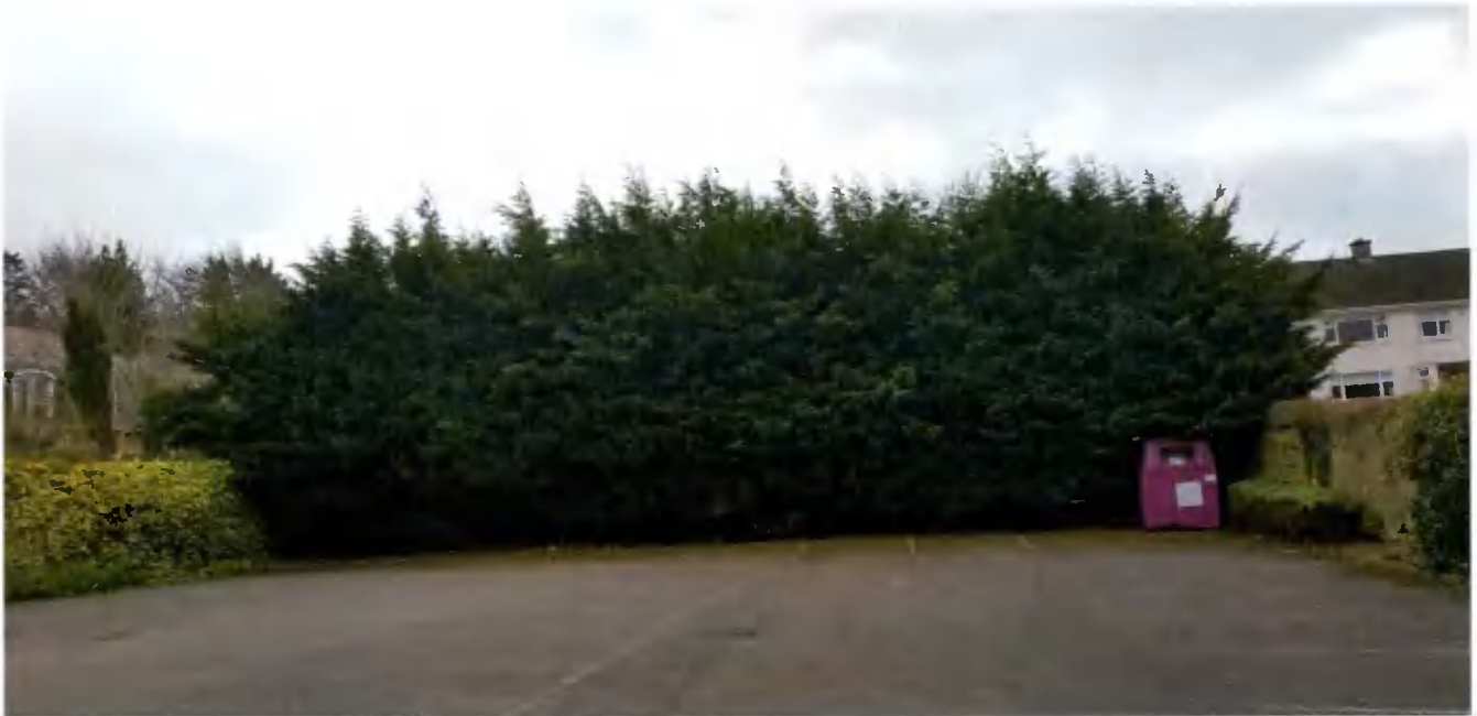
Reference Image 3: Existing Site Photograph (View of subject site (Car Park) seen from Ball Alley House