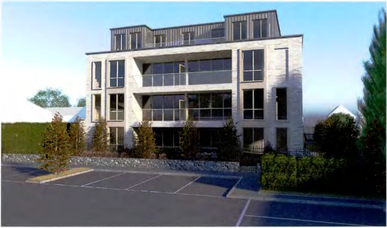
Reference Image 7: Proposal (View of subject site seen from Ball Alley House)