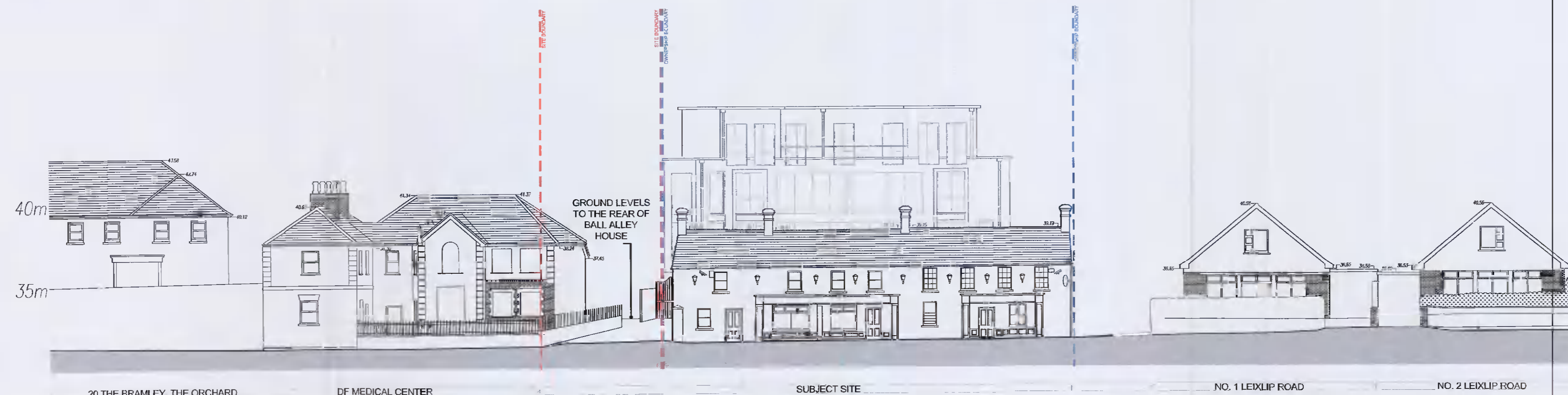
PROPOSED NORTH ELEVATION 4-4 BALL ALLEY HOUSE, LUCAN, CO. DUBLIN Scale: 1:200