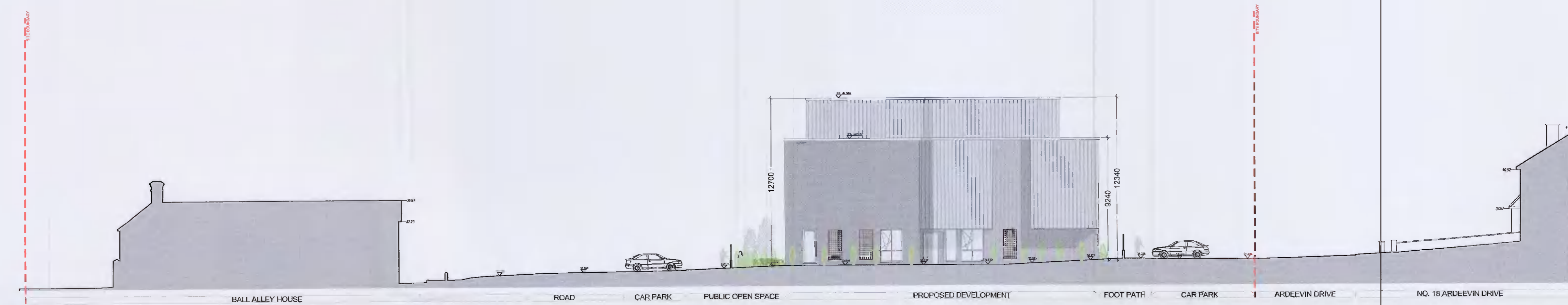
PROPOSED WEST ELEVATION 2-2 BALL ALLEY HOUSE, LUCAN, CO. DUBLIN Scale: 1:200