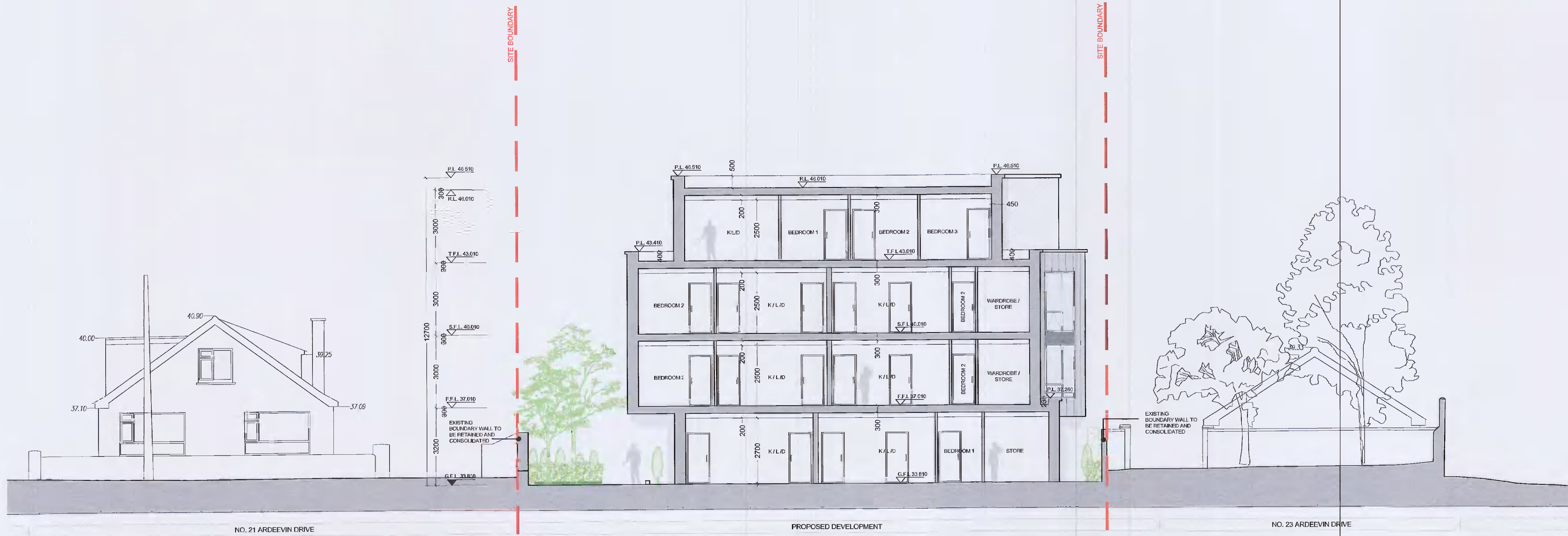
PROPOSED SECTION A-A BALL ALLEY HOUSE, LUCAN, CO. DUBLIN Scale 1:100