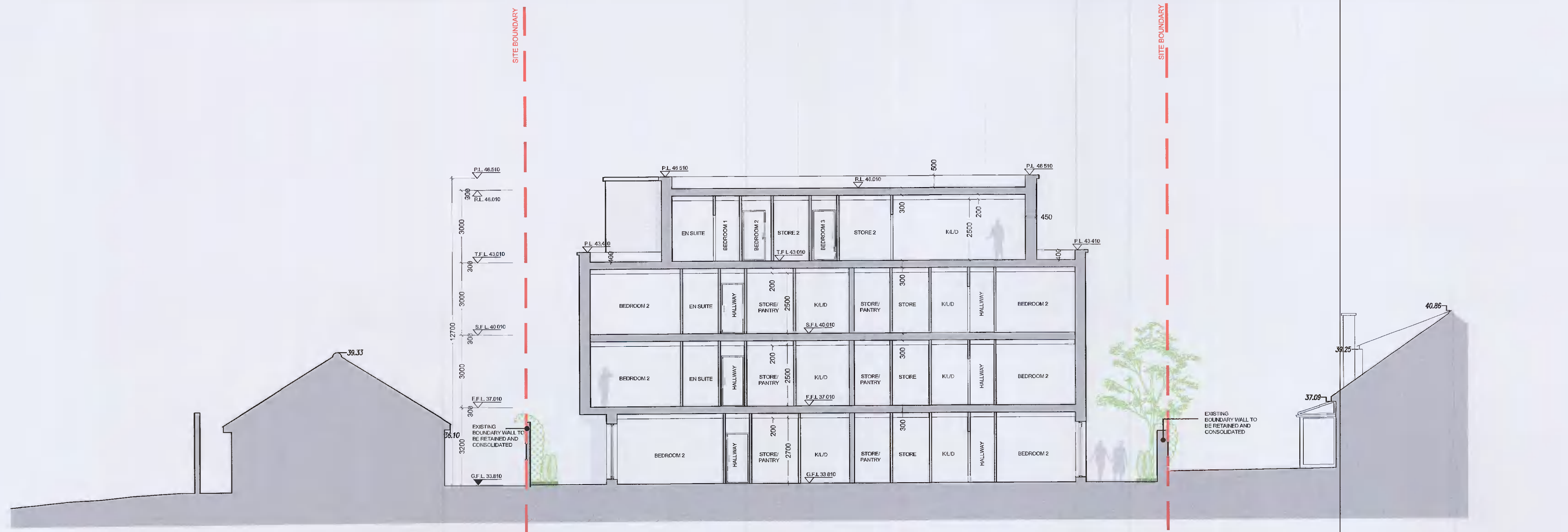
PROPOSED SECTION B-B BALL ALLEY HOUSE, LUCAN, CO. DUBLIN Scale 1:100