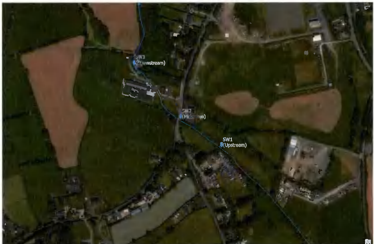
Figure 1 - Map Identifying Stations Sampled as Part of this Assessment