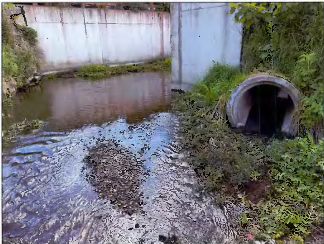
Figure 4 – Map Identifying Sample Site 3 (Downstream).