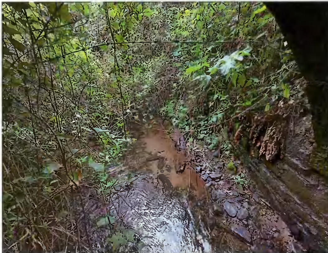
Figure 3 – Map Identifying Sample Site 2 (Midstream).