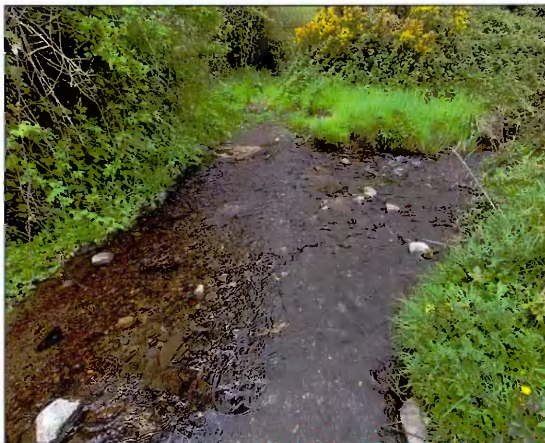
Figure 2 – Map Identifying Sample Site 1 (Upstream).