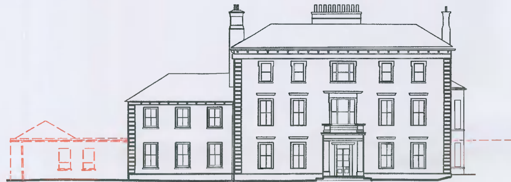
DEMOLITION - ELEVATION TO NORTH - 1:200

NOTE - DOTTED RED LINE INDICATES ELEMENTS PROPOSED FOR REMOVAL OR AMENDMENT