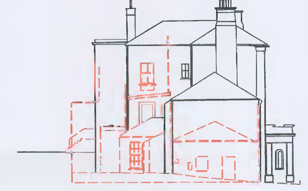
DEMOLITION - ELEVATION TO WEST - 1:200