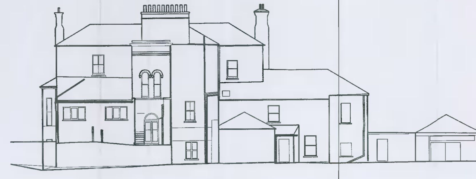
EXISTING - ELEVATION TO SOUTH - 1:200