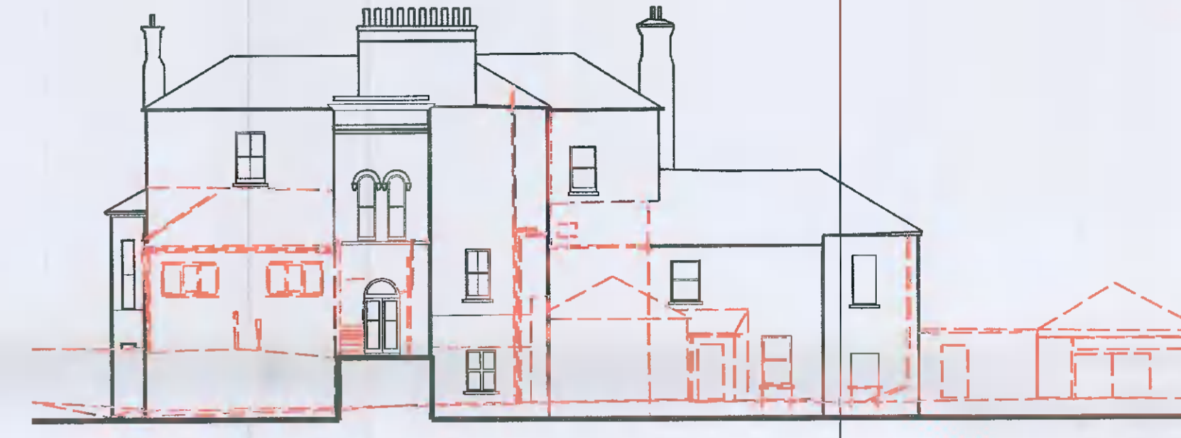
DEMOLITION - ELEVATION TO SOUTH - 1:200