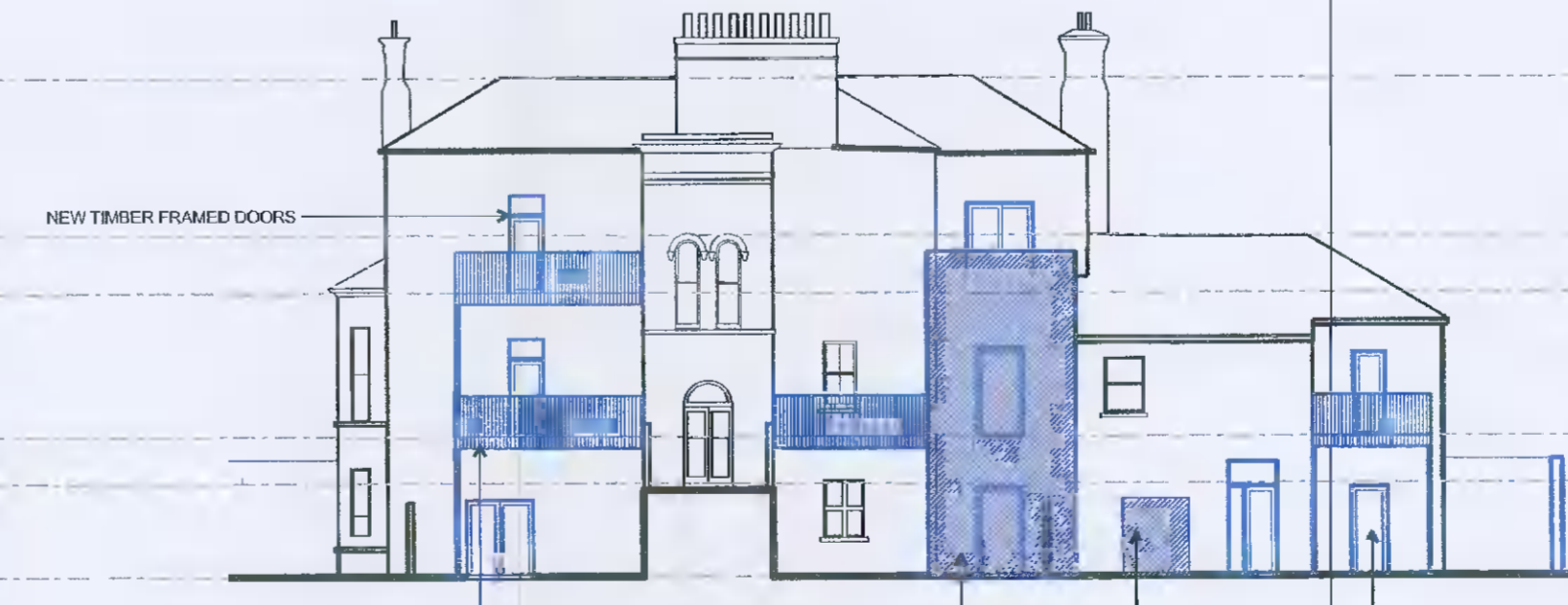
PROPOSED - ELEVATION TO SOUTH - 1:200