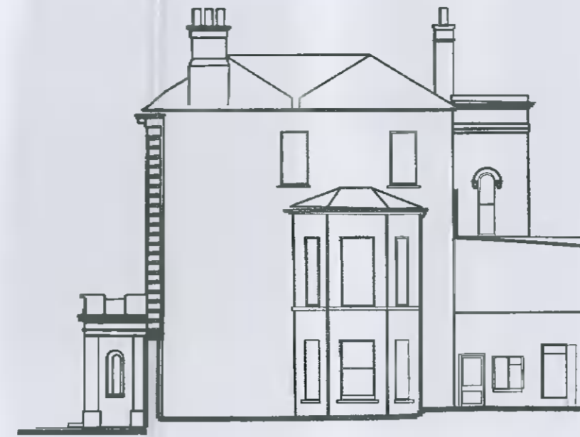
EXISTING - ELEVATION TO WEST - 1:200