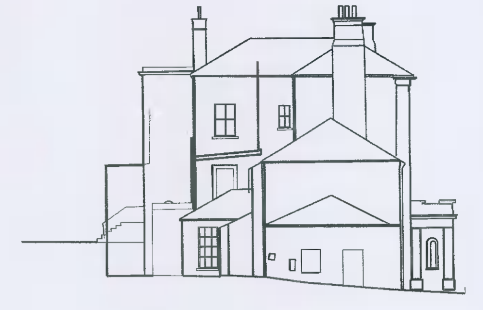
EXISTING - ELEVATION TO WEST - 1:200