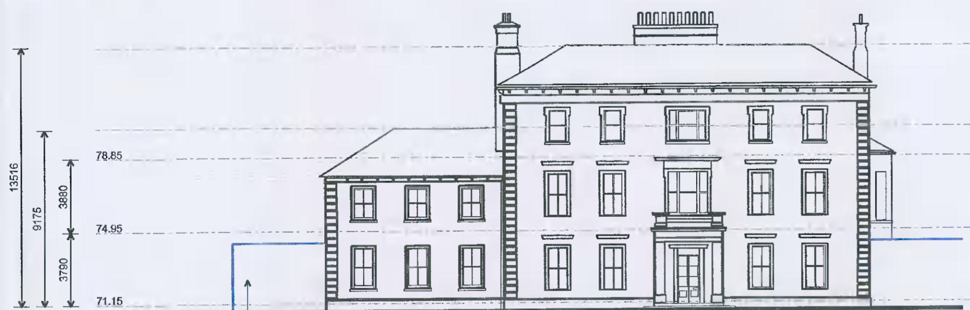
PROPOSED - ELEVATION TO NORTH - 1:200

NOTE - BLUE LINE/HATCH INDICATES NEW BUILD INTERVENTIONS