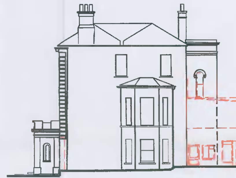
DEMOLITION - ELEVATION TO WEST - 1:200

NOTE - DOTTED RED LINE INDICATES ELEMENTS PROPOSED FOR REMOVAL OR AMENDMENT