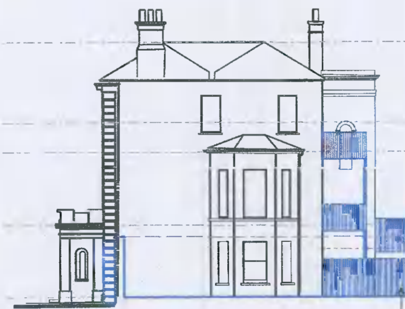
PROPOSED - ELEVATION TO WEST - 1:200

NOTE - BLUE LINE/HATCH INDICATES NEW BUILD INTERVENTIONS