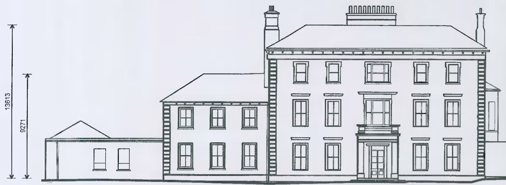
EXISTING - ELEVATION TO NORTH - 1:200