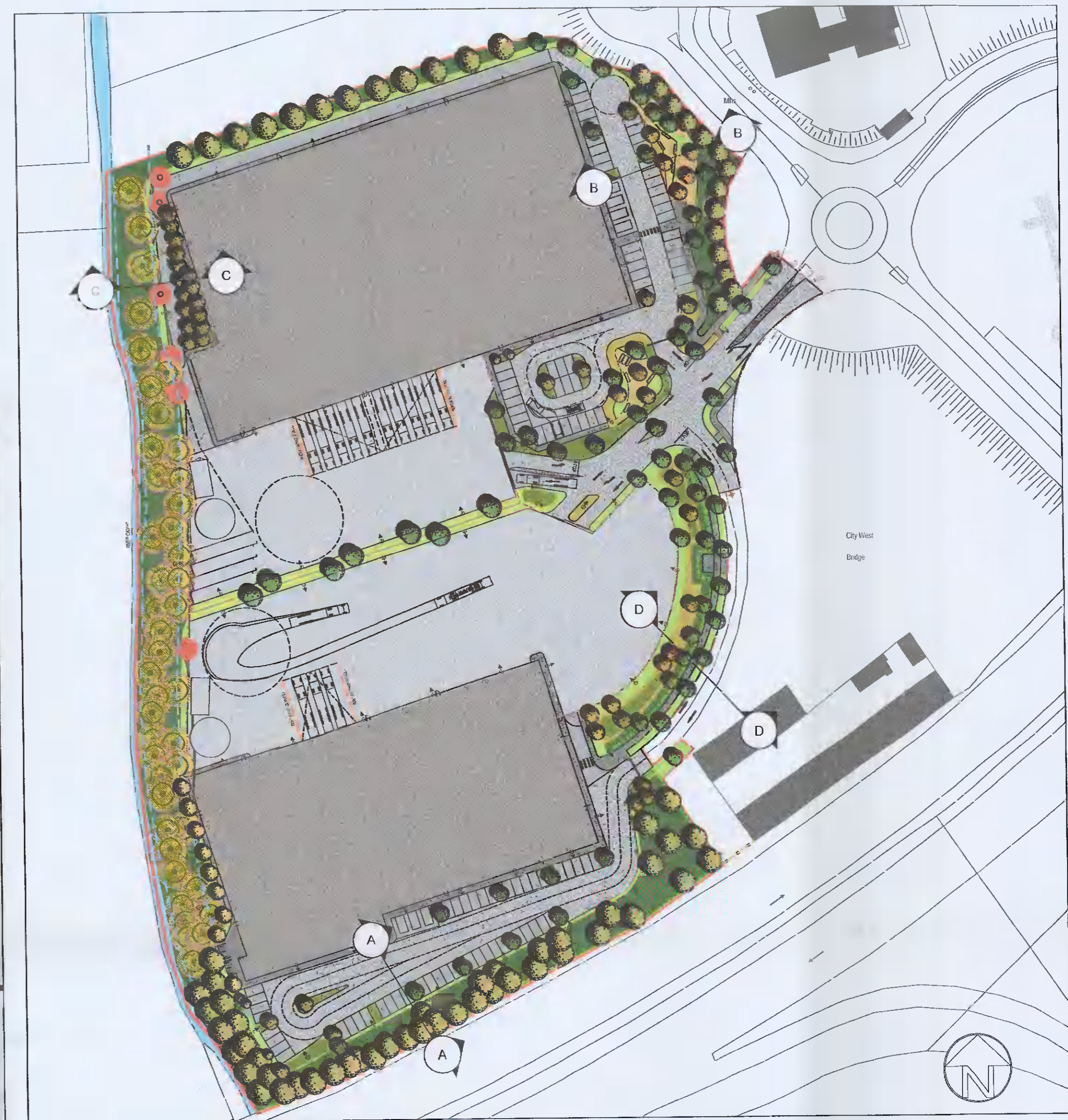
Key Plan scale 1:1000@A1