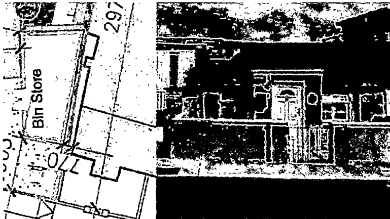
FIG. 71A: PROPOSED BIN STORE PROPOSED TO ADJOIN NO. 10 – COURT COTTAGE – OLD GREENHILLS ROAD

No. 10 cannot reasonably be asked to put up with the noise and smells associated with bin stores. The lids of bins bang when they are dropped, wheeled bins make noise when they are moved, the bins smell, etc. There is no reasonable basis for this bin store to be located as proposed.