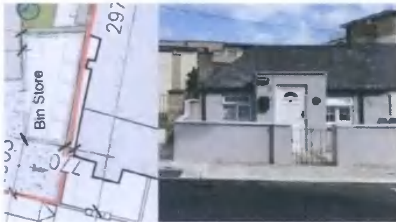
FIG 71A PROPOSED BIN STORE PROPOSED TO ADJOIN NO 10 - COURT COTTAGE - OLD GREENHILLS ROAD

No. 10 cannot reasonably be asked to put up with the noise and smells associated with bin stores. The lids of bins bang when they are dropped, wheeled bins make noise when they are moved, the bins smell, etc. There is no reasonable basis for this bin store to be located as proposed.