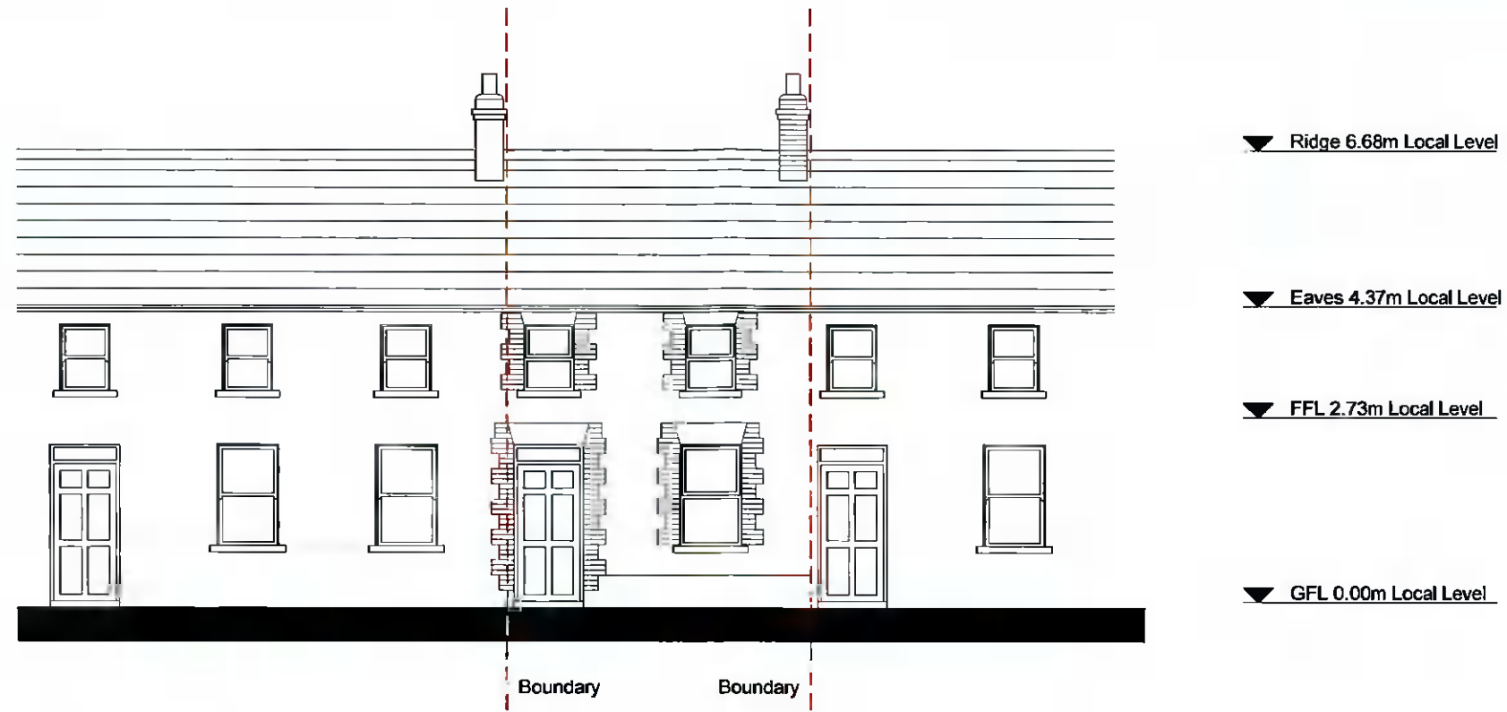
1 PROPOSED: WEST (FRONT) ELEVATION PP04