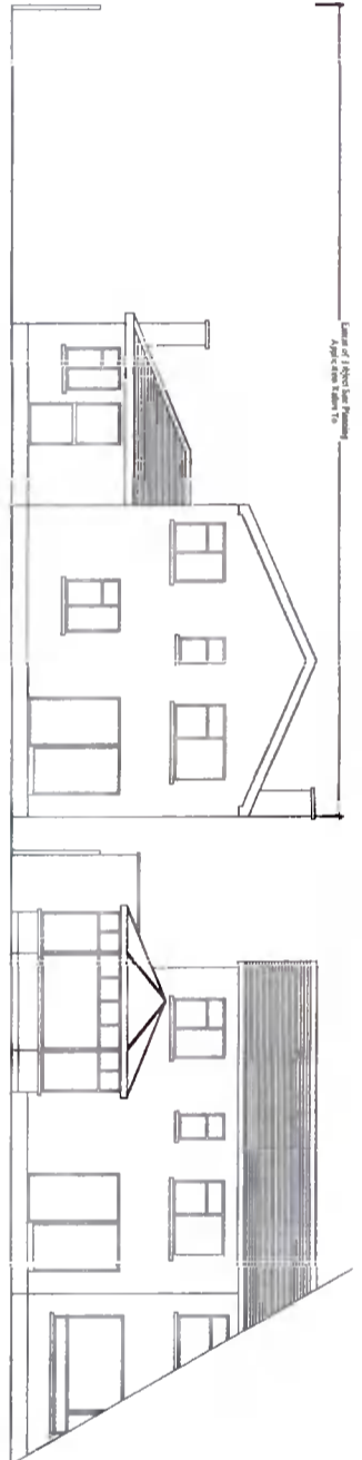
Existing Contiguous Elevation (Rear)