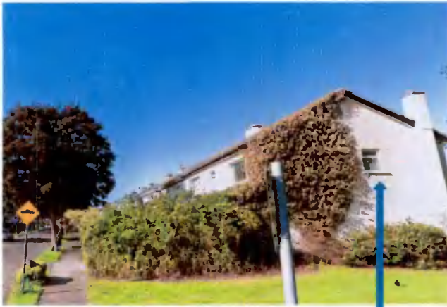
3 Rushbrook way — window in party wall with public space , similar to what is proposed in our development -Granted approval