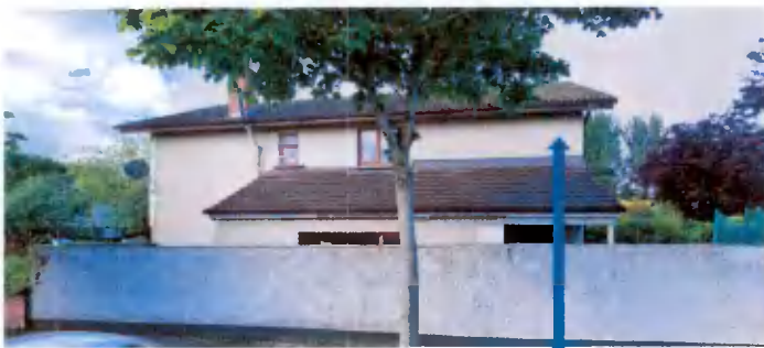
SD16B/0067 -30 Rossmore Grove — rear building line has moved beyond established building line by way of first floor rear extension, like what is proposed in our development - Granted approval in 2016