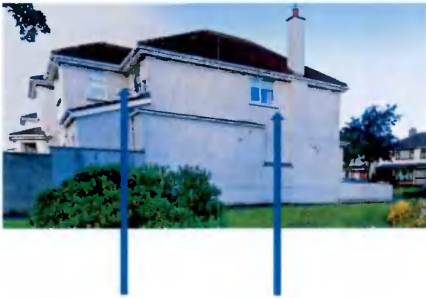
SD06B/0532 -176 Orwell Park View — window in party wall with public space & and rear building line has moved beyond established building line , similar to what is proposed in our development -Granted approval in 2006