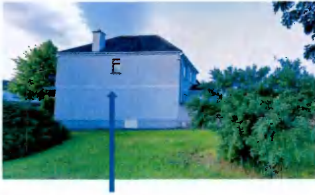
SD06A/0794 -177A Orwell Park Heights — window in party wall with public space & and rear building line has moved beyond established building line , similar to what is proposed in our development -Granted approval in 2006