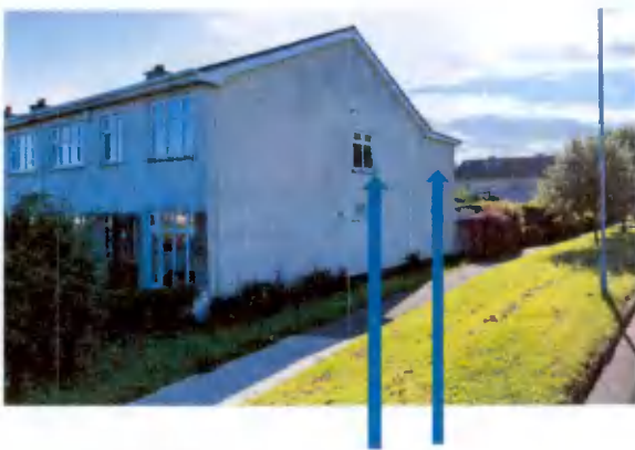
1 Osprey drive — window in party wall with public space & and rear building line has moved beyond established building line , similar to what is proposed in our development -Granted approval