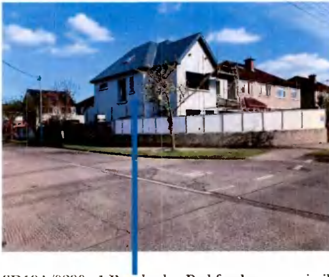
SD19A/0280 -1 Brookvale , Rathfarnham — similar roof type to what is proposed in our development -Granted approval in 2019

Should you need anything further, please contact the undersigned.