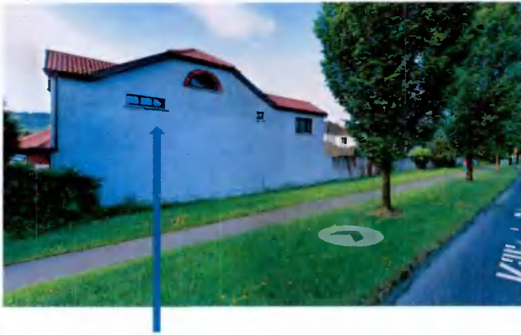
SD15B/0321 -2 wood dale green — window in party wall with public space & and rear building line has moved beyond established building line, similar to what is proposed in our development -Granted approval in 2015