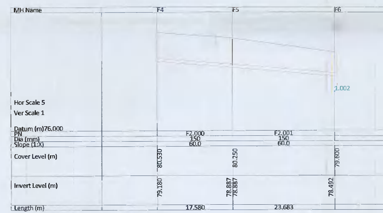
WASTEWATER NETWORK F2.000 - F2.001