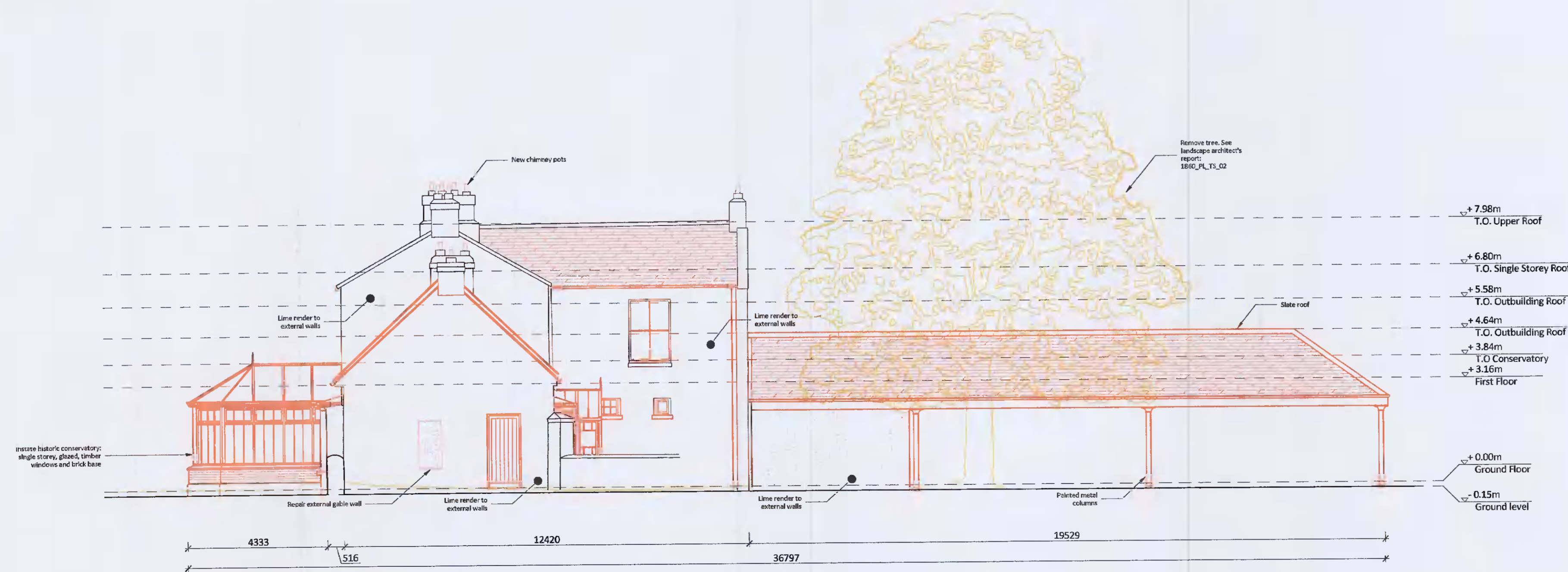
3 PROPOSED EAST ELEVATION SCALE 1:100

Note: This drawing is the copyright of Lotts Architecture and Urbanism Ltd. This drawing is to be read in conjunction with specifications and all other consultants' drawings. All dimensions to be checked on site. Architects must be informed of any discrepancies before work proceeds. Do not scale off drawings.