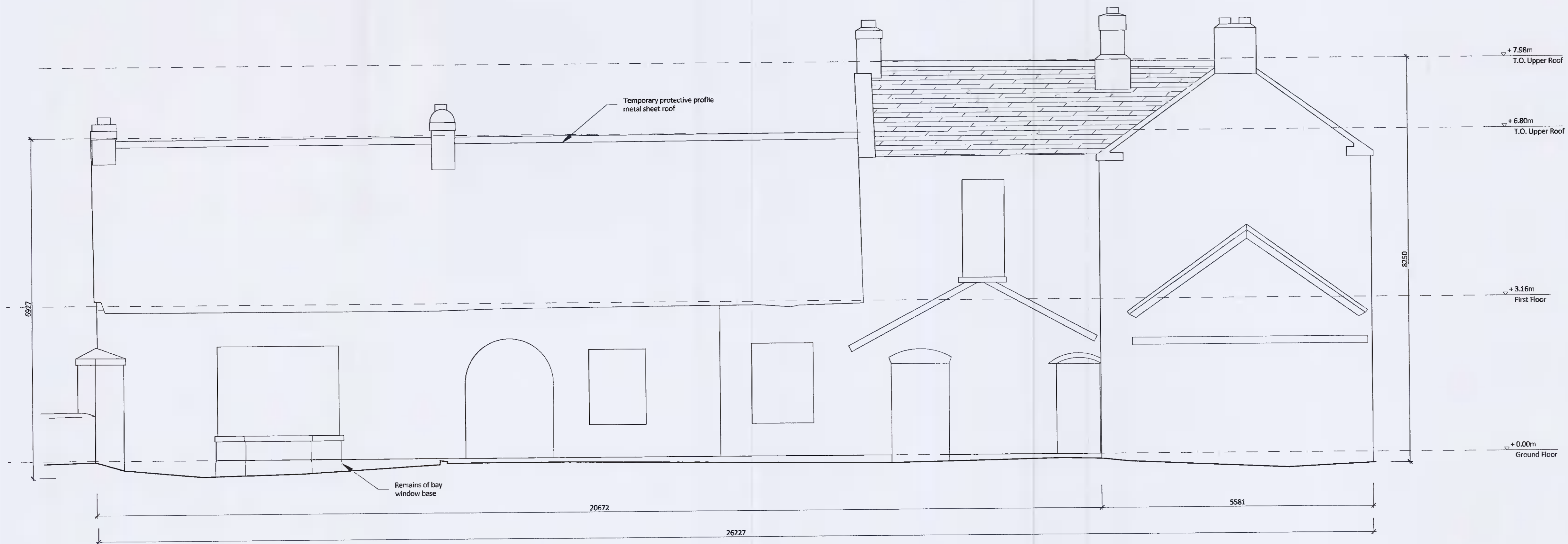
1 EXISTING NORTH ELEVATION SCALE 1:50