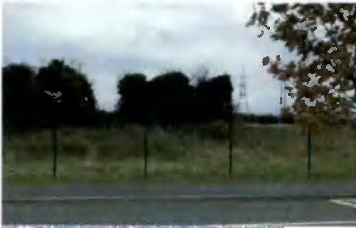
Photo 3: View of existing structure of site looking from existing primary school across field