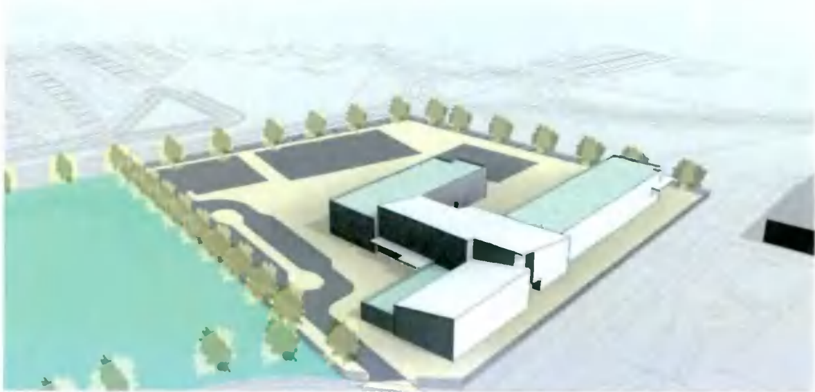
Massing Study of Proposed School Development

The Site Layout is very much informed by the SDZ Planning Scheme in terms of layouts, orientation, building frontages and interfaces with future road developments. In order to present a defined street frontage, the school massing consists of a 2 and 3 Storey structure running North-South facing on to the proposed future link road. The PE Hall is located at the north east of the Building to facilitate out of hours use. The Main Entrance to the school is via the North Elevation which opens in the GP area. This is the heart of the school and all the other wings of the school radiate from this central location. The GP Area also looks on to the generous south facing courtyard and kickabout spaces.