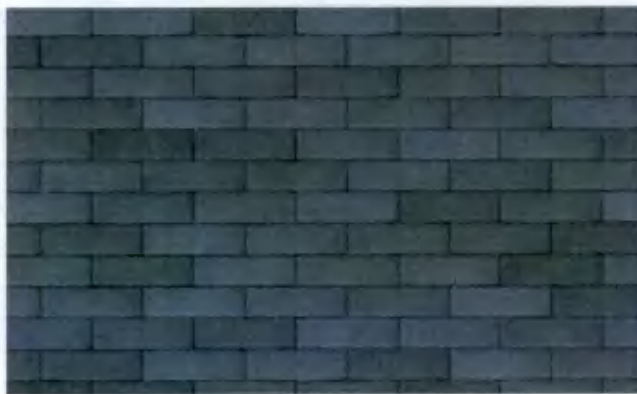
Sample of Dark Brick Proposed

Signage zones have been identified on the enclosed architectural drawings on the northern and western elevations of the building and at the main entrance to the north west.