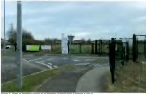
Photo 1: View of 2 existing entrances to Primary School from Griffeen Avenue