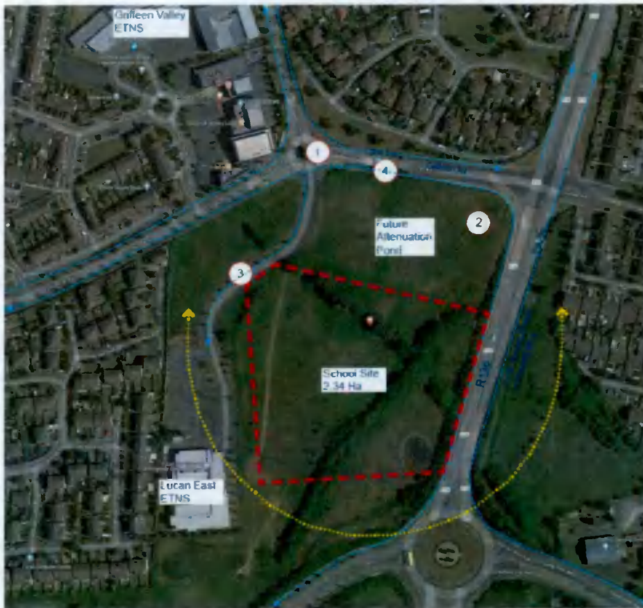
Aerial view Site outlined in red

Kishogue Community College is located approx. 500m to the southeast of the site. Griffen Community College are currently using a number of classrooms in this building on a temporary basis.