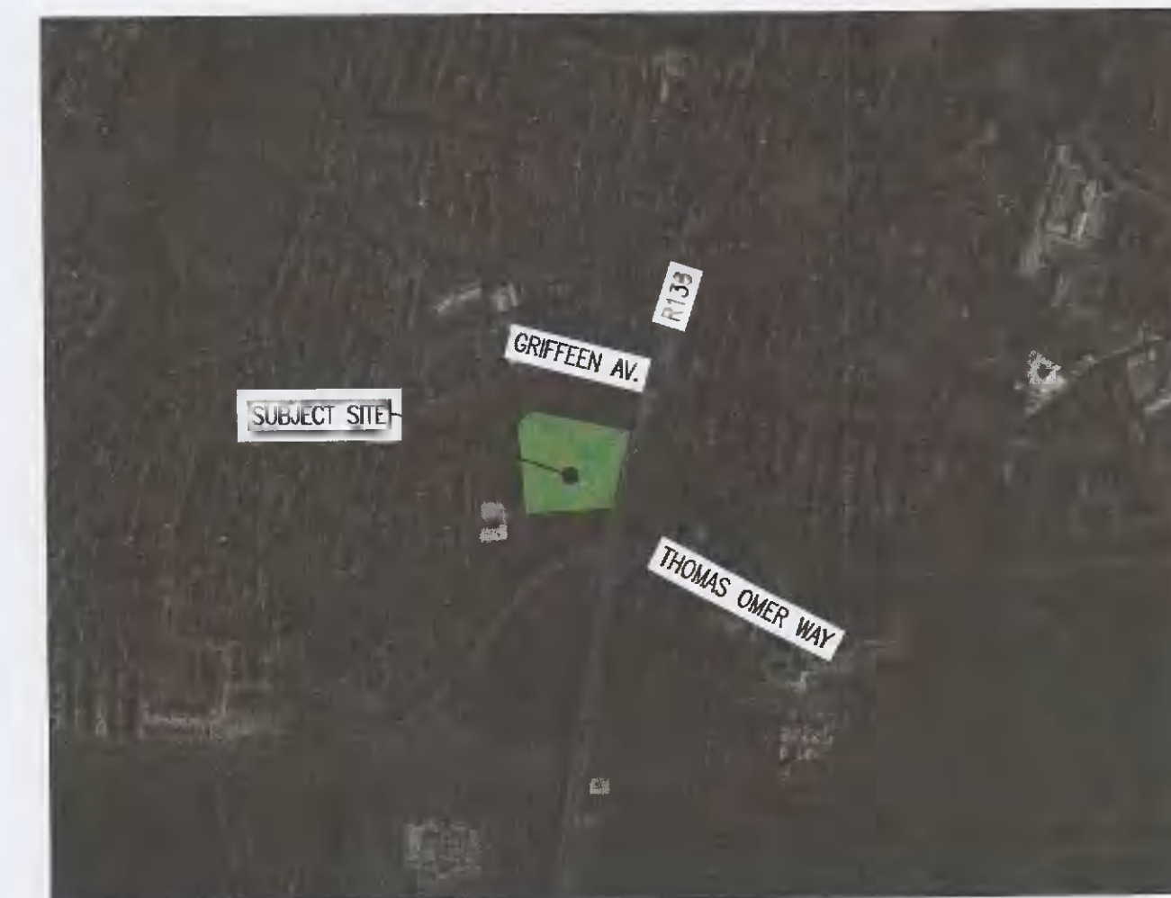
SITE LOCATION MAP N.T.S